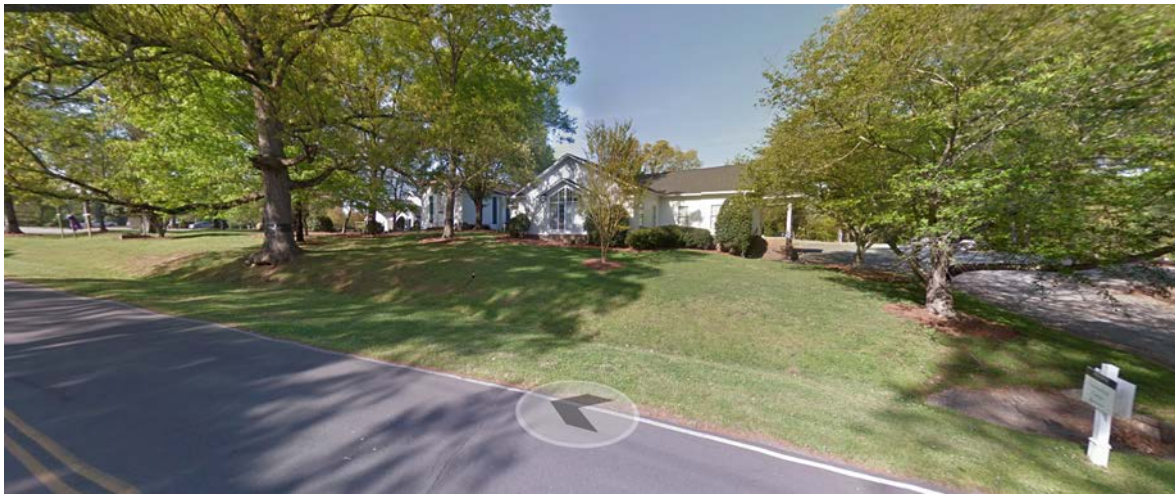
South of the site between Providence Road and Providence Church Lane is Providence Presbyterian Church.