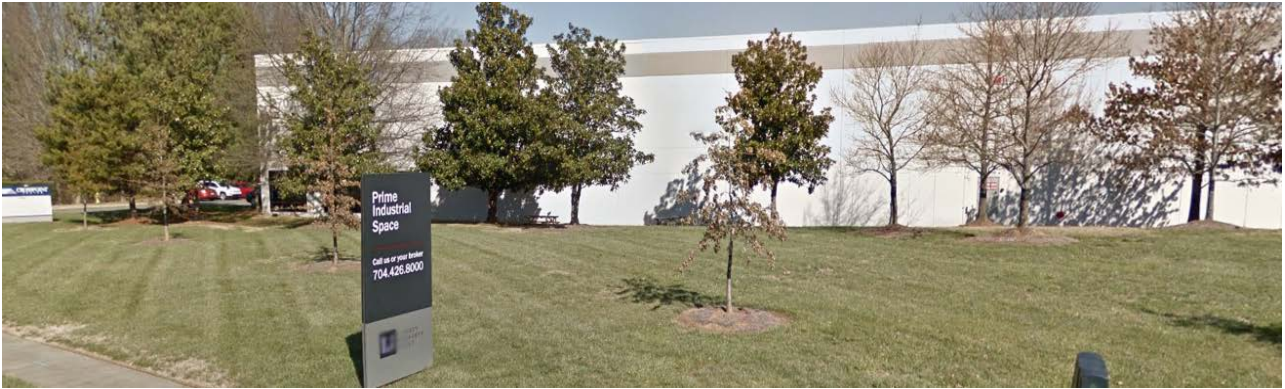
Properties to the south, across Cindy Lane, are developed with industrial uses.