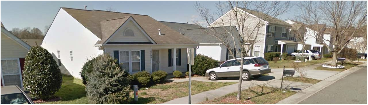
Single family homes surround most of the site.