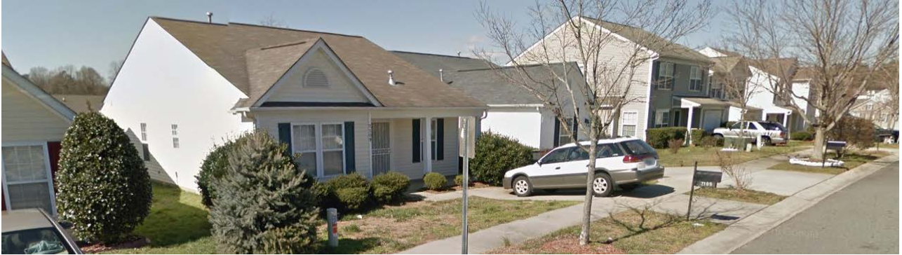
Single family homes surround most of the site.