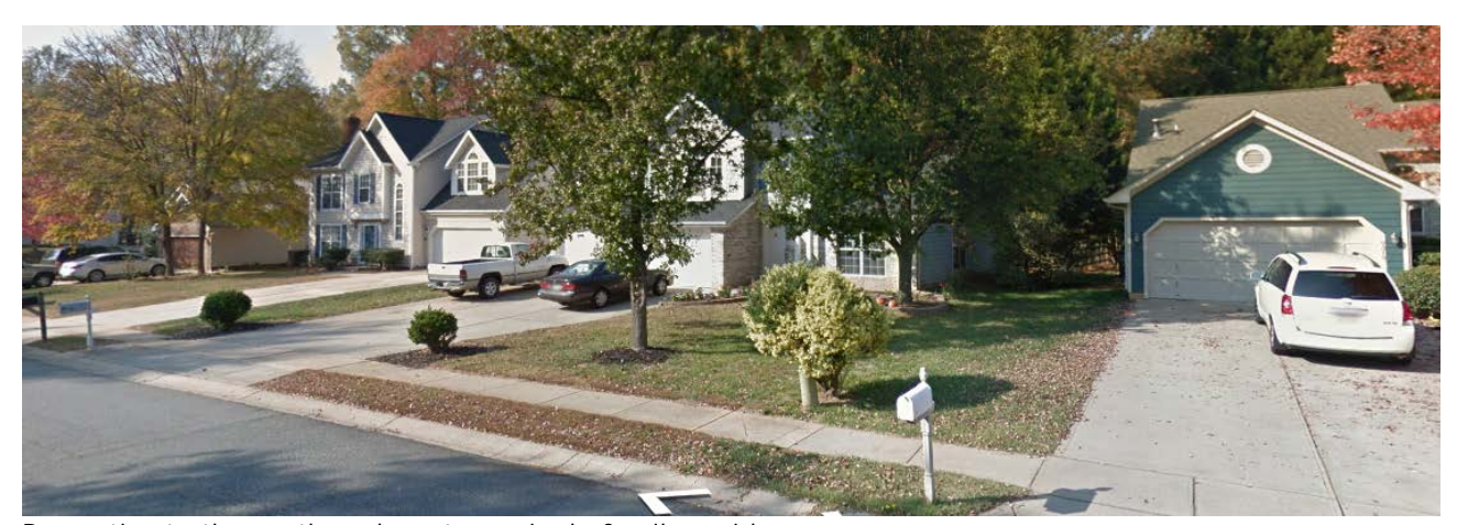
Properties to the north and west are single family residences.