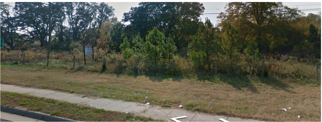
The subject property is vacant.