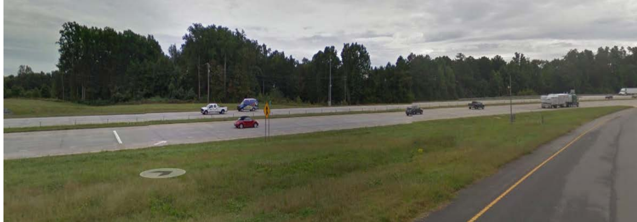
The subject property is bordered by Interstate 485.