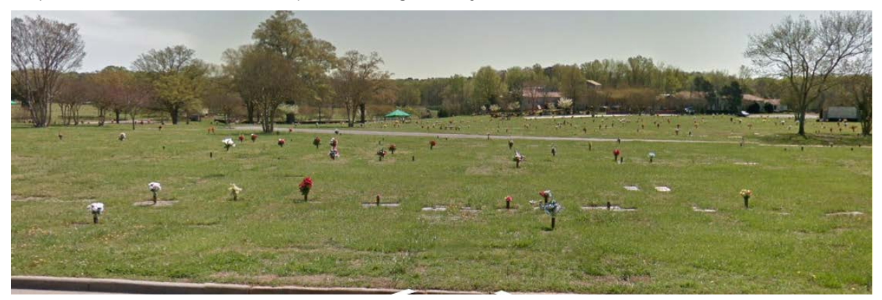
Sharon Memorial Park borders the neighborhood.