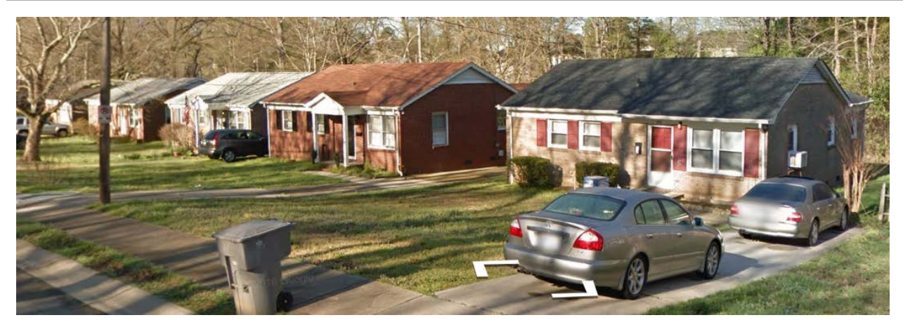
Properties to the south are developed with single family homes.