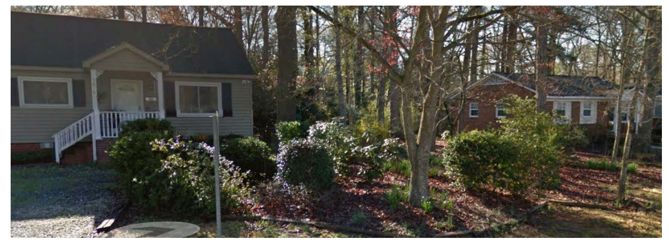
The subject property is developed with two single family homes.