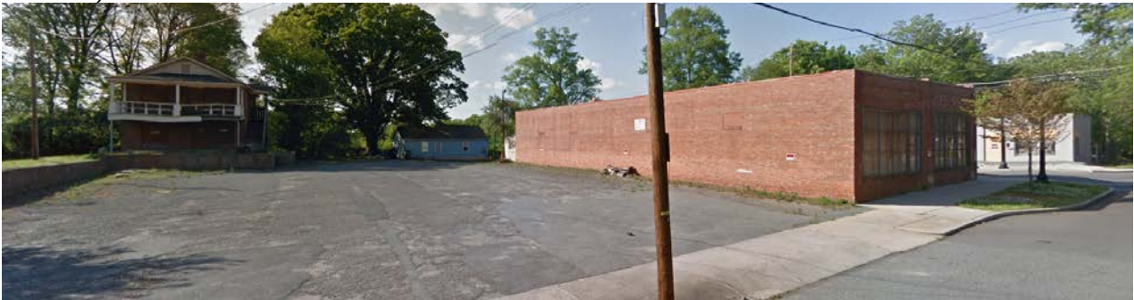
1035 Harrill Street – A commercial structure is located in B-1 (neighborhood business).