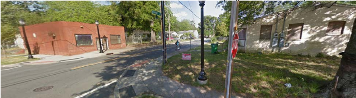
Properties to the south of the subject property include a commercial building and single family residential.