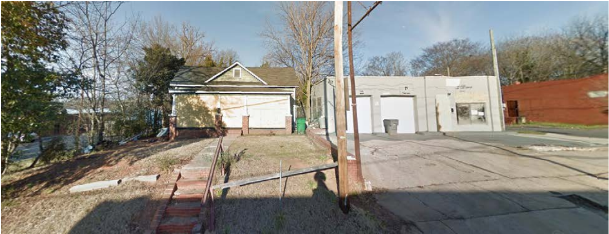
923 Belmont Avenue – A service garage and single family home are located in B-1 (neighborhood business).