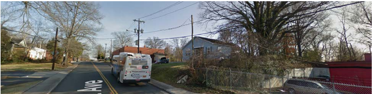
Properties to the north of the subject property include one single family home, a church, and a convenience store.