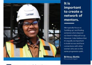
Turner celebrating WOMEN IN CONSTRUCTION WEEK 2023