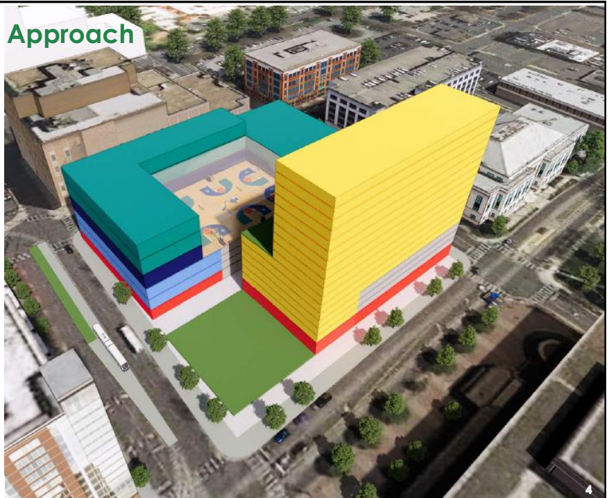
Conceptual Massing Only