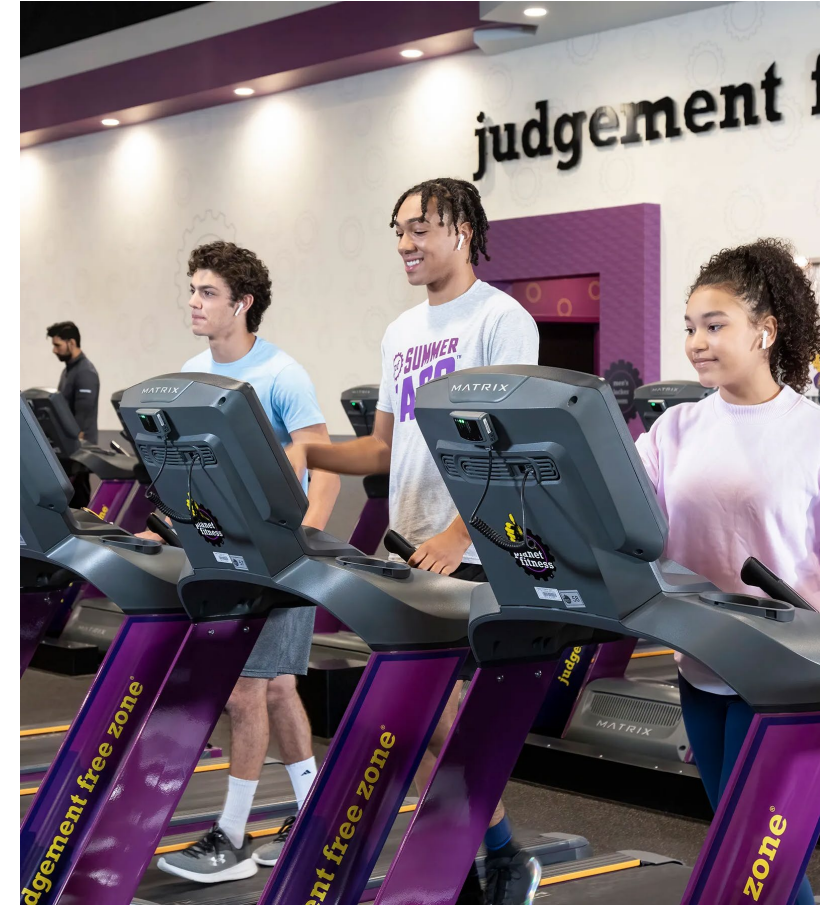
Commercial Fitness Center