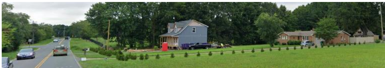
Streetview of large lot single family residential uses to the south of the site along Choate Circle.