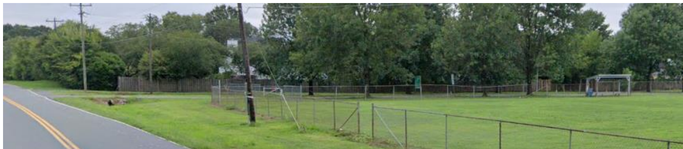
Streetview of recreational and single family residential uses to the west of the site across Choate Circle.