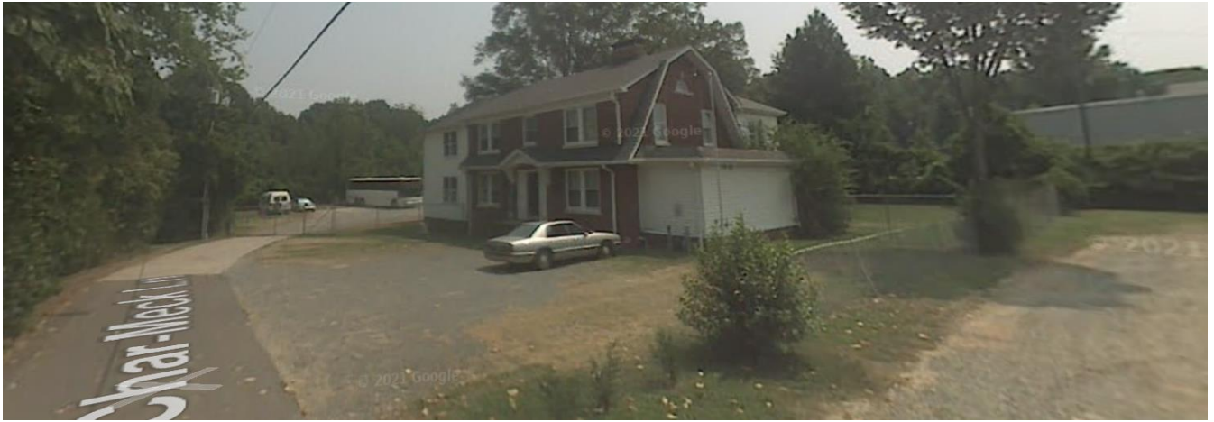
The site currently has a home on the property.