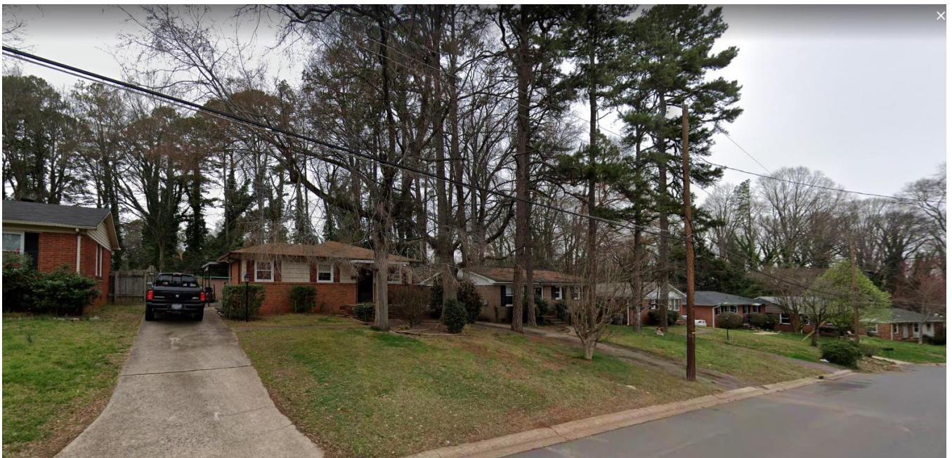
North of the site there are single family residential homes.