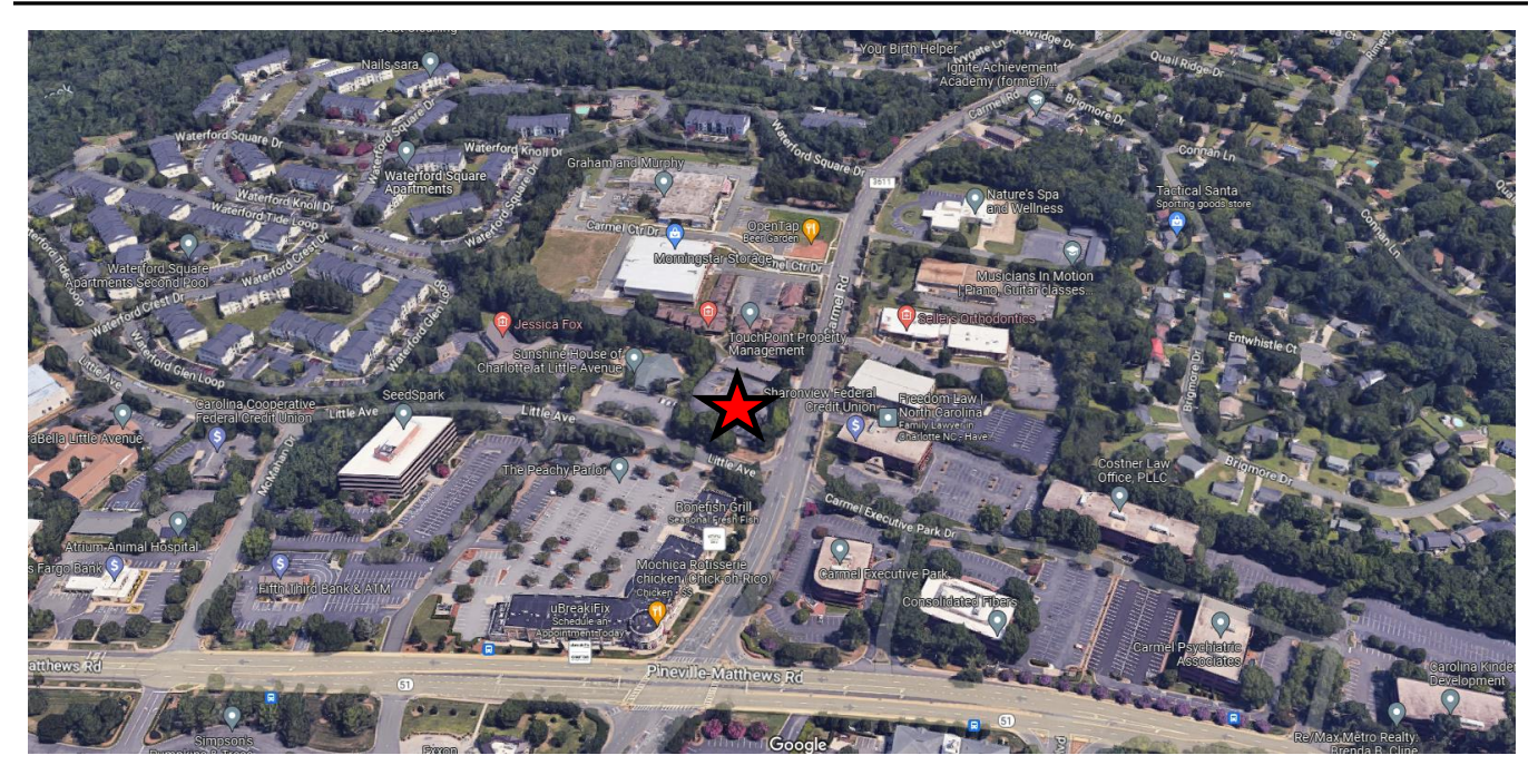
The site, indicated by the red star above, is located north of the Carmel Commons Shopping Center in an area with a mix of commercial, office and multi-family uses. Single family uses are located in the neighborhoods accessed further north off Carmel Road.