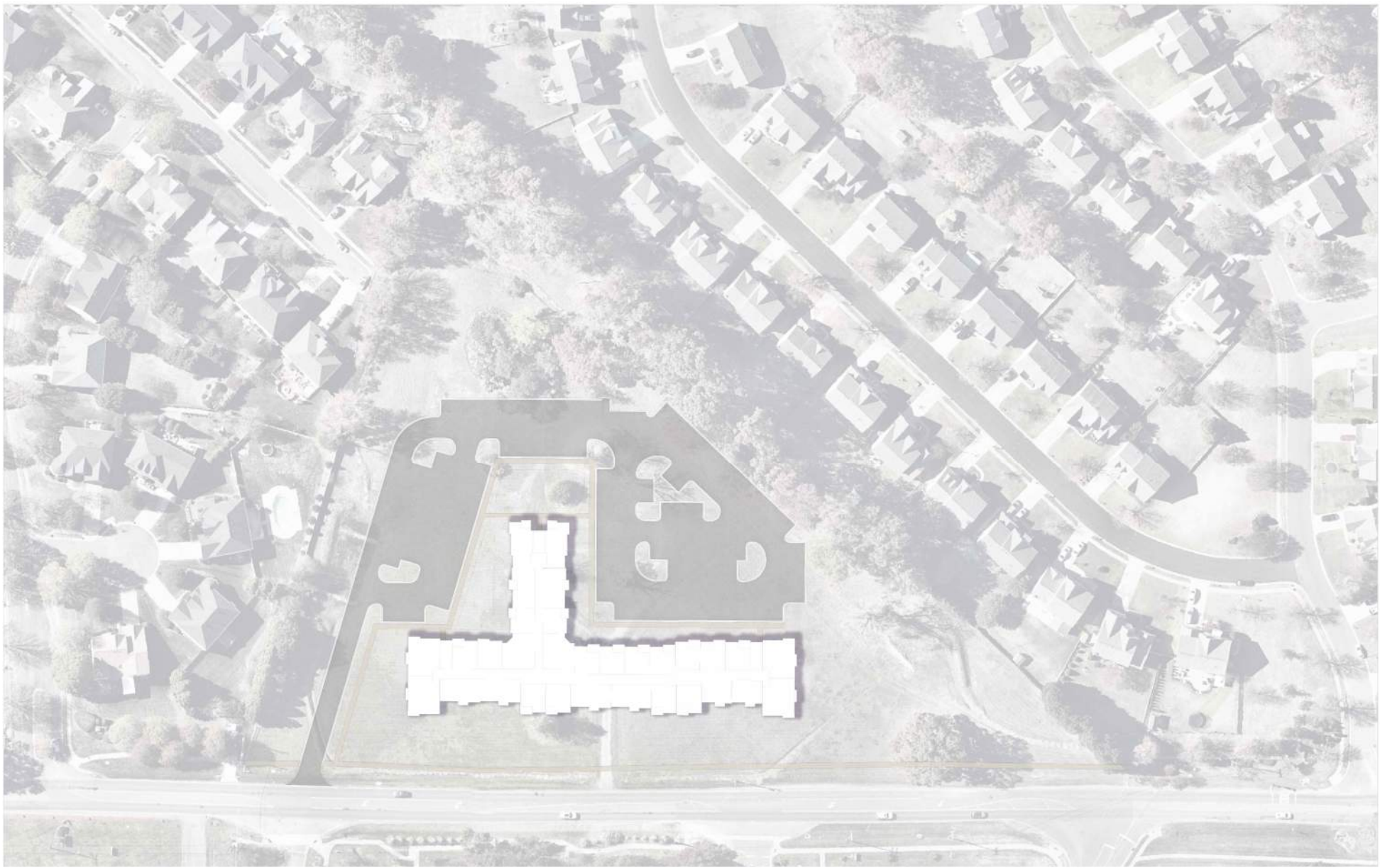
IMPACT PLAN: (N.T.S.) 1. MINOR IMPACT TO TREES ON THE BORDER OF THE SITE

NOTE: 1. THIS RENDERING IS CONCEPTUAL IN NATURE AND SUBJECT TO CHANGE. THE RENDERING IS INTENDED TO ILLUSTRATE THE BUILDING AND PARKING PLACEMENT. THE FINAL LANDSCAPING, TREE SAVE AND BUFFERS MAY BE MODIFIED BUT WILL ADHERE TO THE REQUIREMENTS OF THE ORDINANCE.