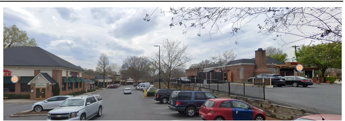
• South of the site are various commercial uses.