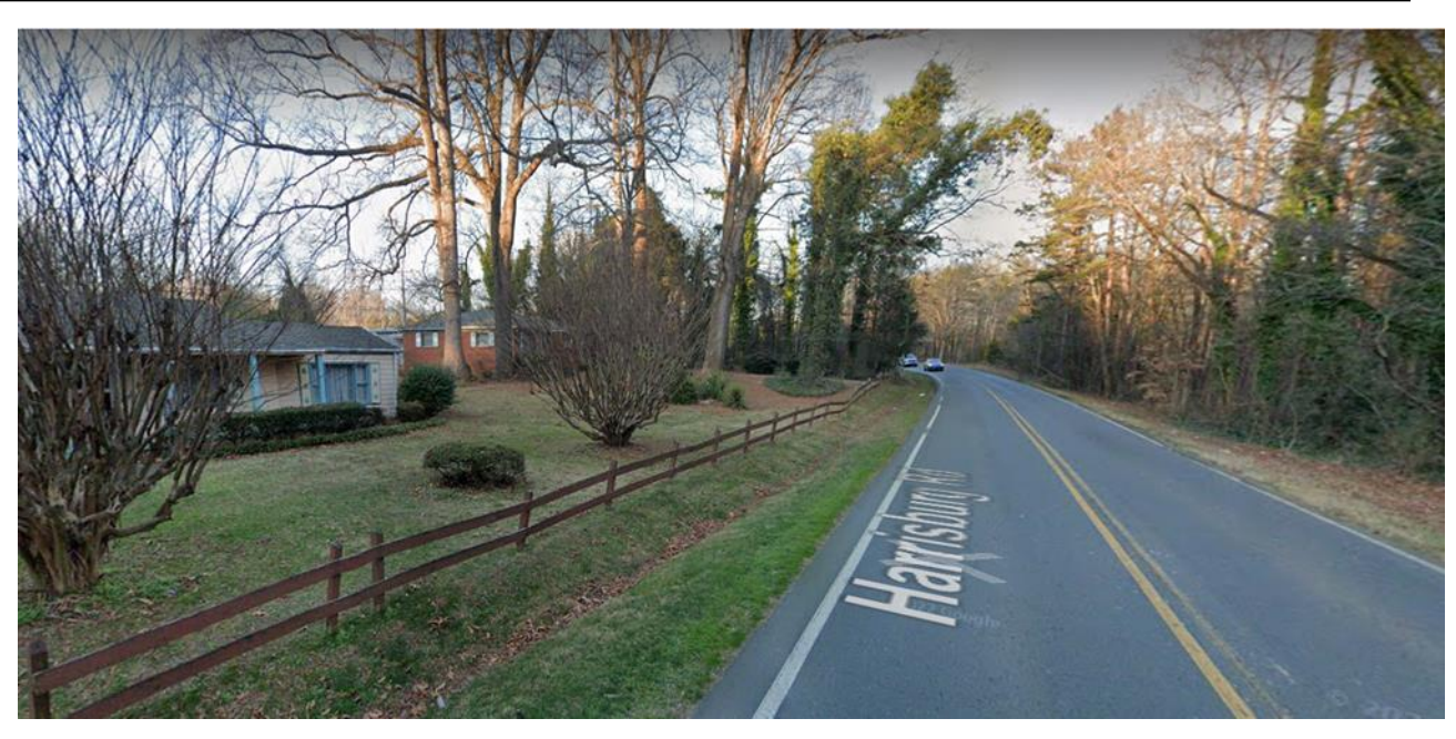
North, along Harrisburg Road, are large lot single family homes.