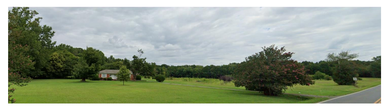
The site is developed with two single-family homes and the remainder vacant.