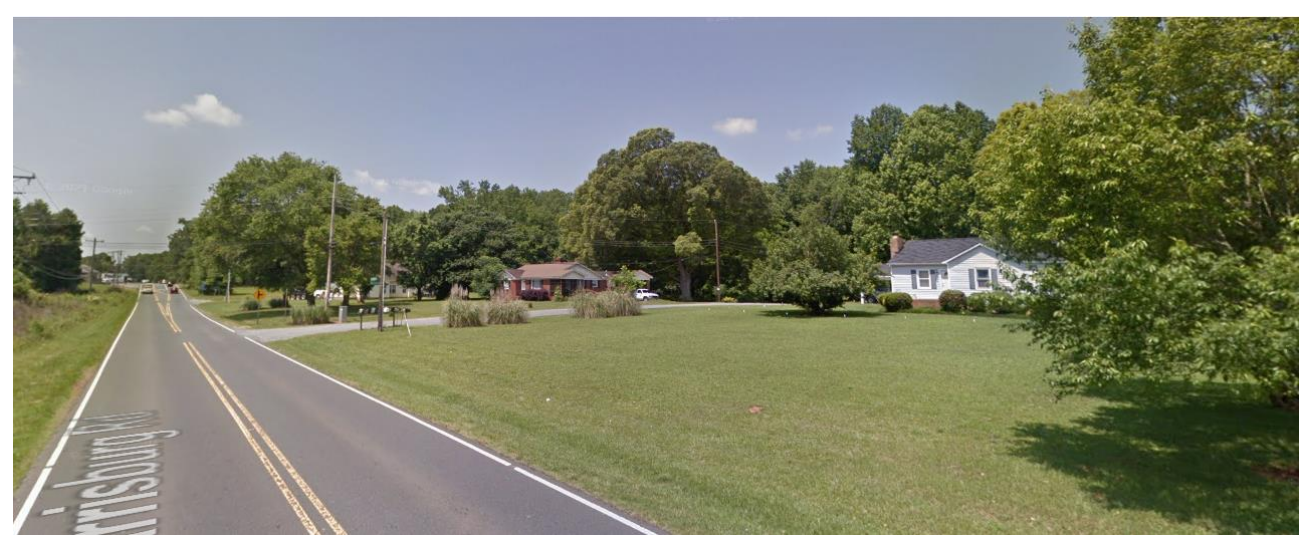
South are large lot single family homes.