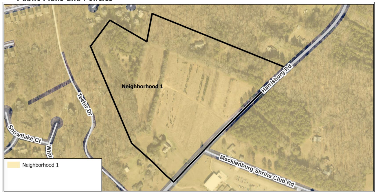
The Charlotte Future 2040 Policy Map recommends the Neighborhood 1 place type for this site.