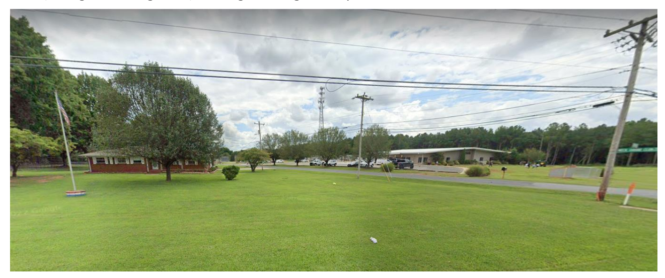
East, across Harrisburg Road, are large lot single-family homes and religious facility.