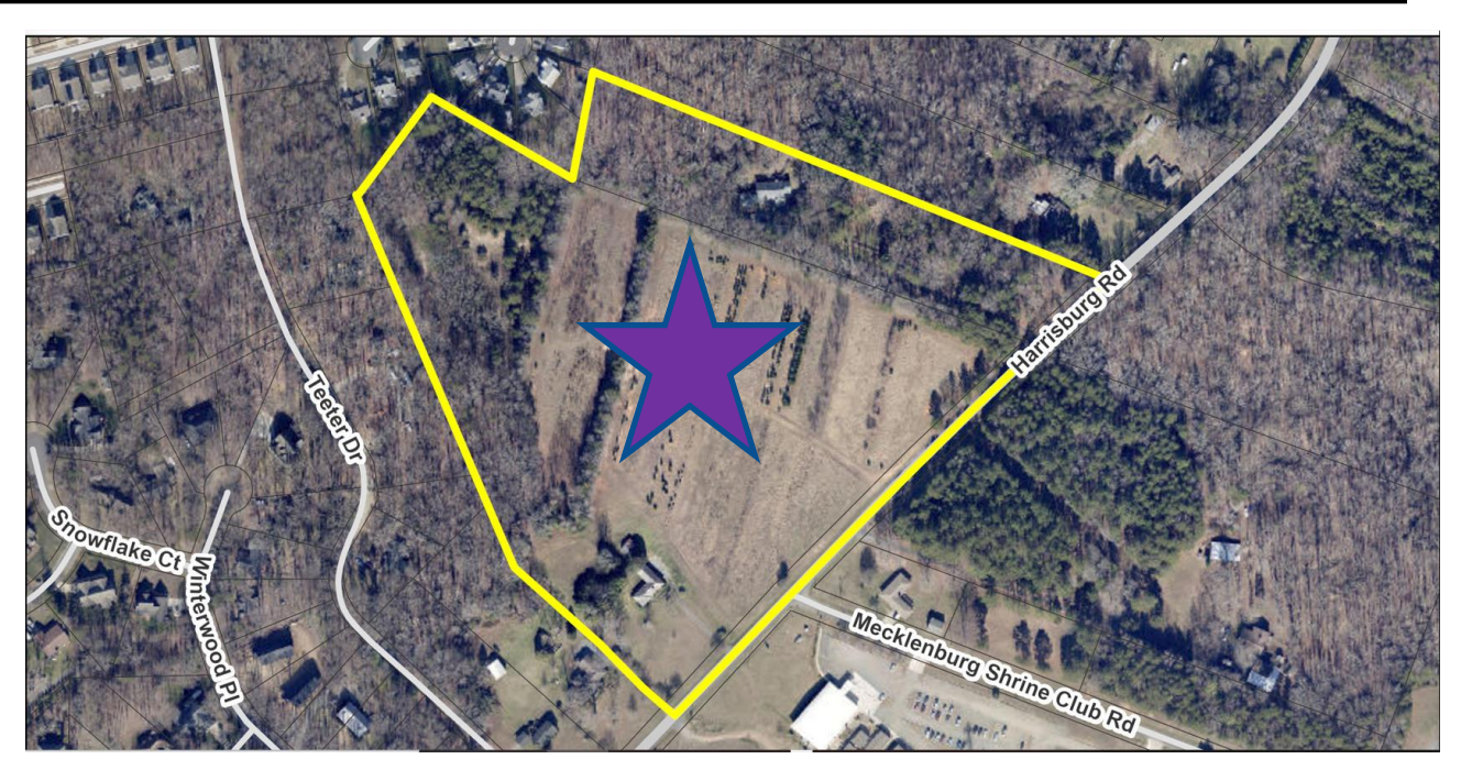
The site (denoted by purple star) is surrounded by large lot single family homes, single family neighborhoods, institutional use, and vacant land.