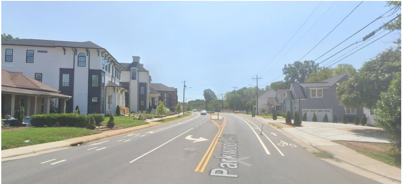
East, along Parkwood Avenue, are single family homes, multi-family residential developments, and commercial uses.