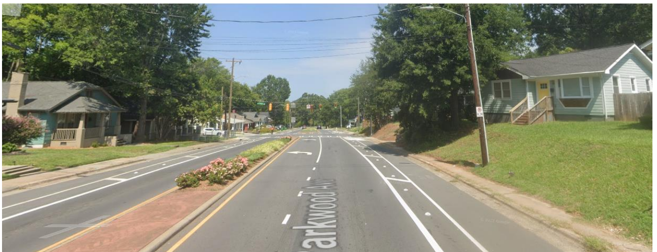
West, along Parkwood Avenue, are single family homes.