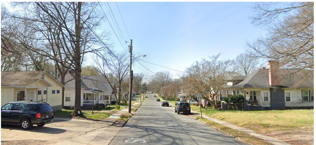
South are single family homes.