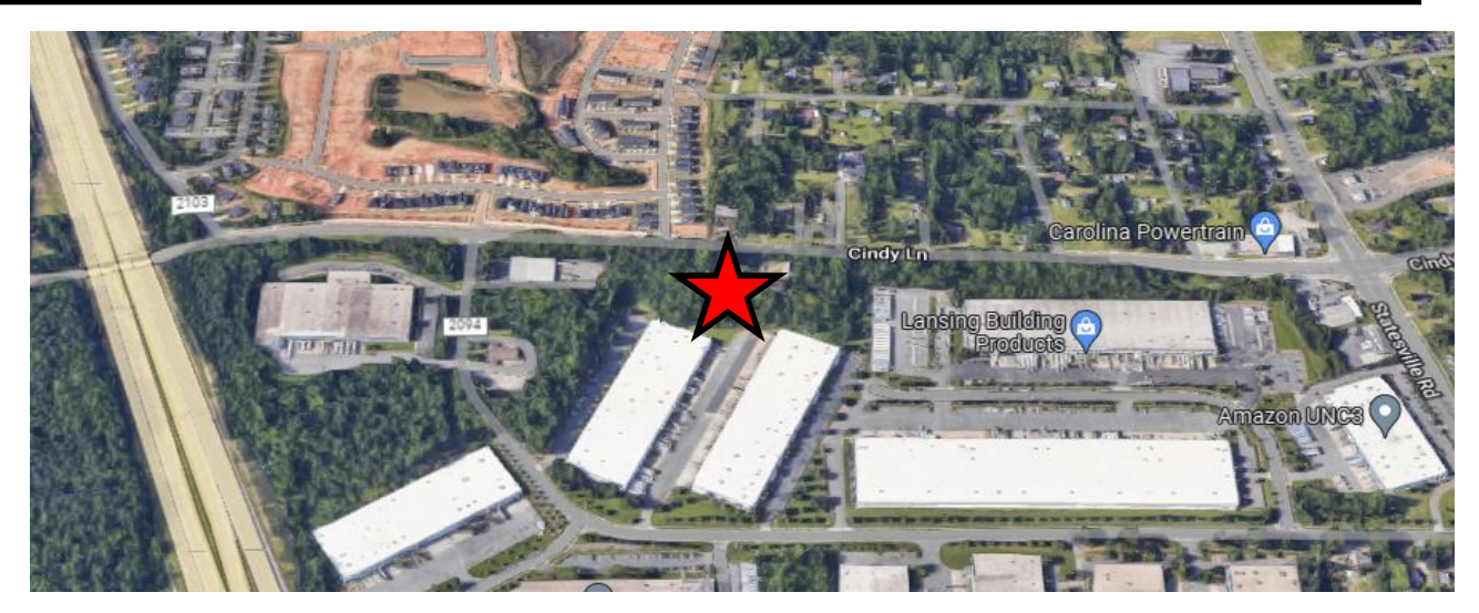
The site, marked by a red star, is surrounded primarily by industrial uses. The properties across Cindy Lane and the property immediately to the east are zoned for residential uses.

Petition 2021-244 (Page 3 of 5) Final Staff Analysis