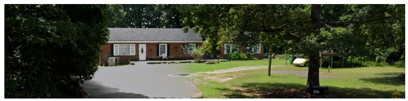
The property to the east of the site is developed with a single family residence.