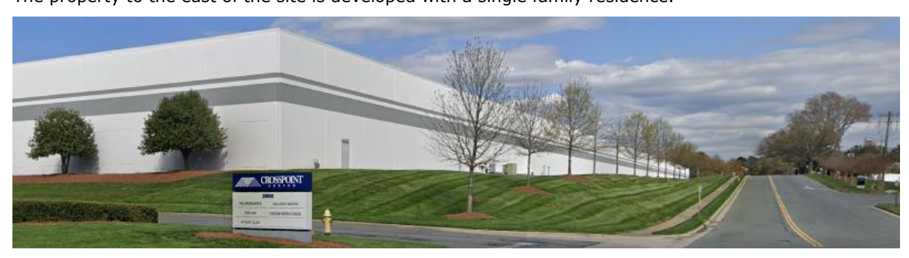
The properties to the south of the site along Hutchinson McDonald Road are developed with industrial uses.