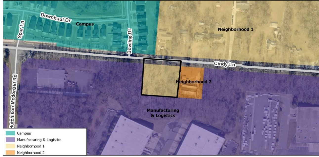
The 2040 Policy Map recommends Neighborhood 1 for this site.