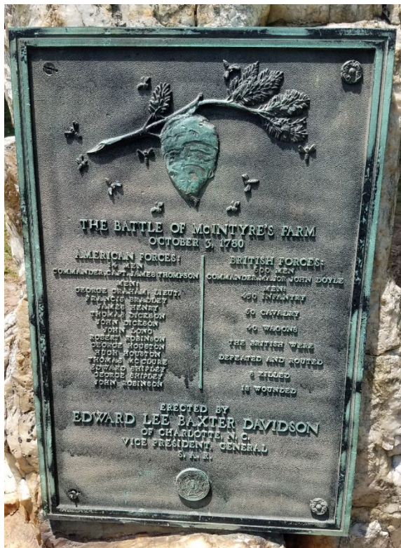
Plaque on Battle of McIntyre's Farm Monument