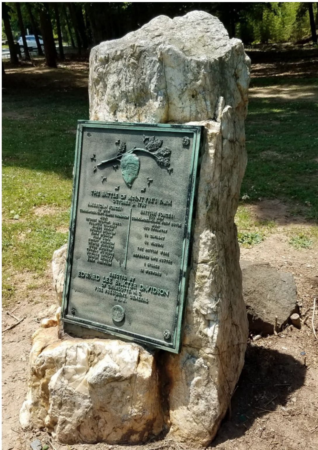
Northeast face of Battle of McIntyre's Farm Monument