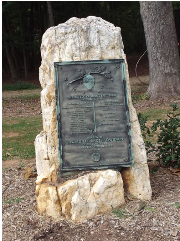
Northeast face of Battle of McIntyre's Farm Monument