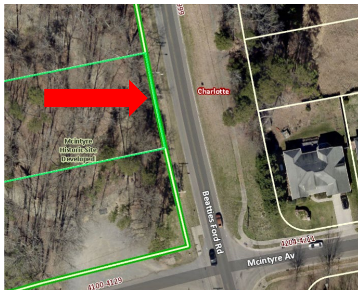
Aerial Image of Battle of McIntyre's Farm Monument (arrow indicates location)

The Battle of McIntyre's Farm Monument is unique among the various E. L. Baxter Davidson Historic Markers and Monuments in north Mecklenburg County, in that it is comprised of a single narrow boulder, light brown in color and intermittently laden with quartz deposits. The monument stands on property immediately adjacent to the McIntyre Farm Site, which is located at the corner of Beatties Ford Road and McIntyre Avenue. Because the monument is not physically situated on the McIntyre Farm Site, it was not originally included within the physical description of the 1974 Charlotte city ordinance designating the farm site as a local historical landmark. 1 Standing approximately 15 feet off a busy Beatties Ford Road corridor, the monument's continued integrity is at risk, given the rapid growth of vehicular traffic in the immediate area.