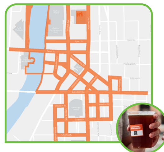
Grand Rapids, Michigan State Law Similar to NC