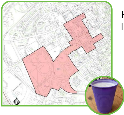
Huntsville, Alabama Incremental Approach