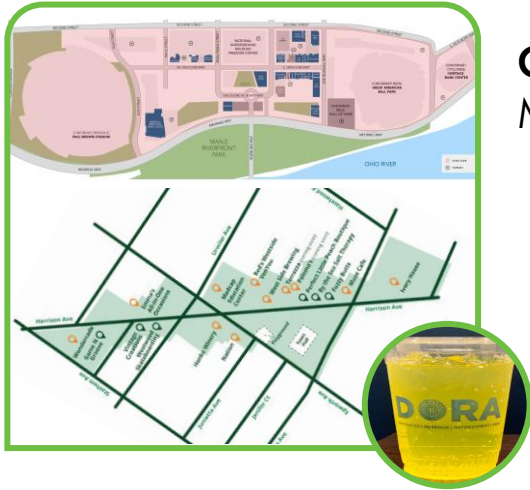
Cincinnati, Ohio Multiple Districts