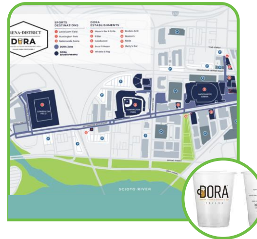
Columbus, Ohio Stadium Based District