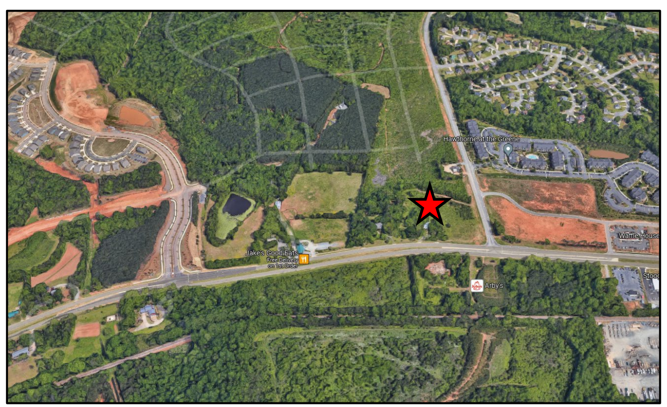
General location of subject property denoted by red star. Early phases of Cresswind seen to left; Adjacent Woodland Beaver commercial center located directly to the right of the star.

Petition 2020-181 (Page 4 of 7) Final Staff Analysis