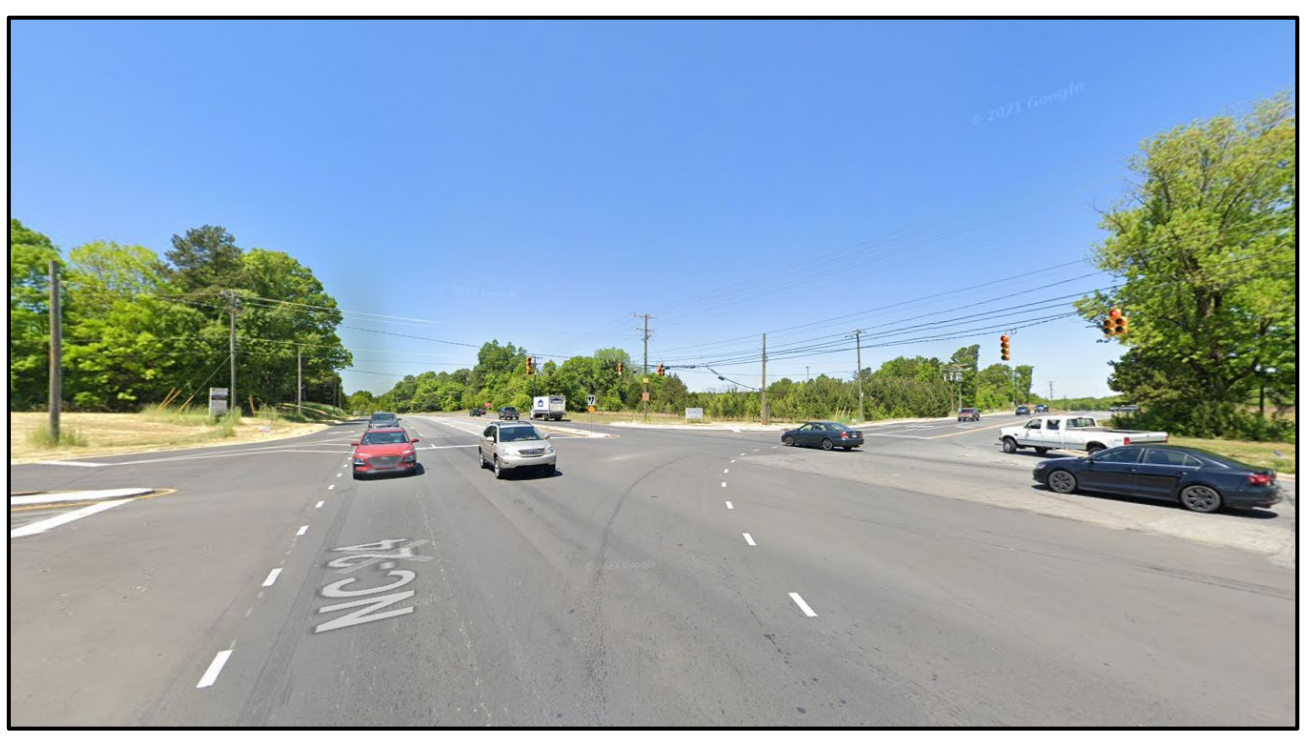
Streetview along Albemarle Road looking NW toward the site. Left of the street is Mint Hill's zoning jurisdiction and is also seeing new development in the vicinity of the site.