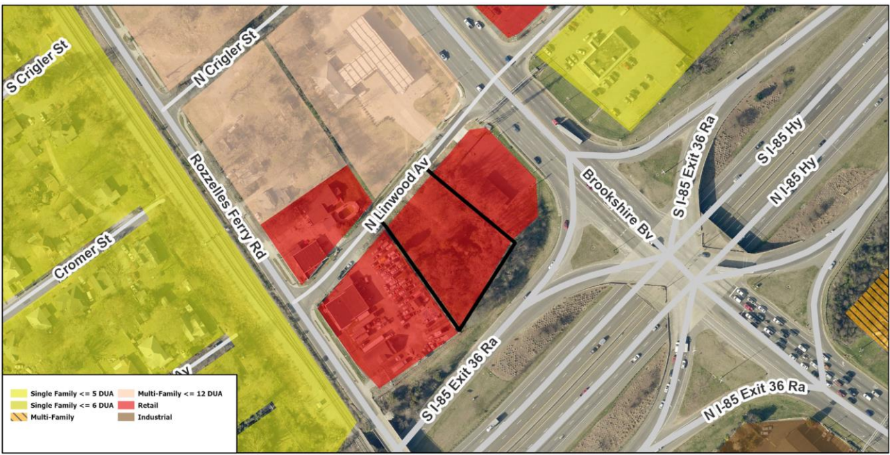
The Thomasboro/Hoskins Small Area Plan (2002) recommends retail uses on the site.