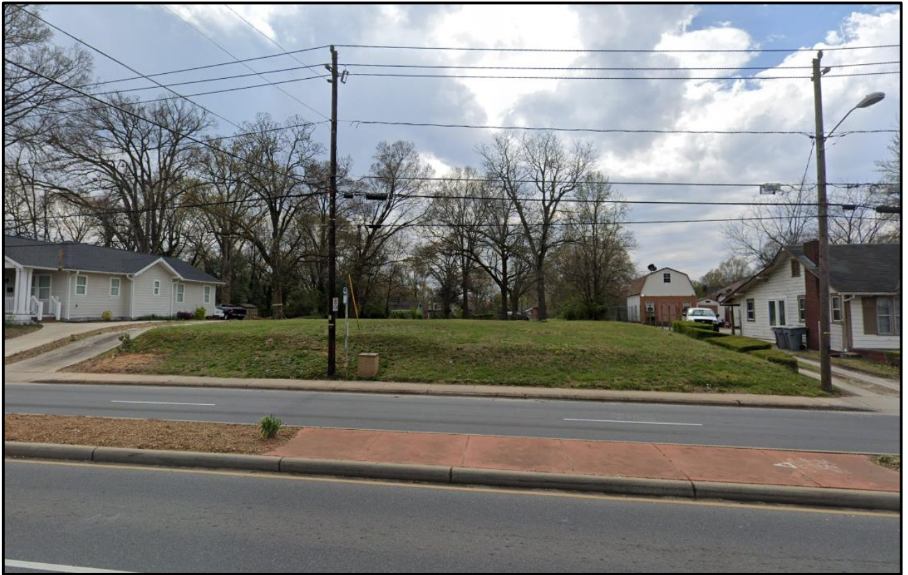
View of the subject property as seen from Parkwood Avenue. Single family homes are on either side.