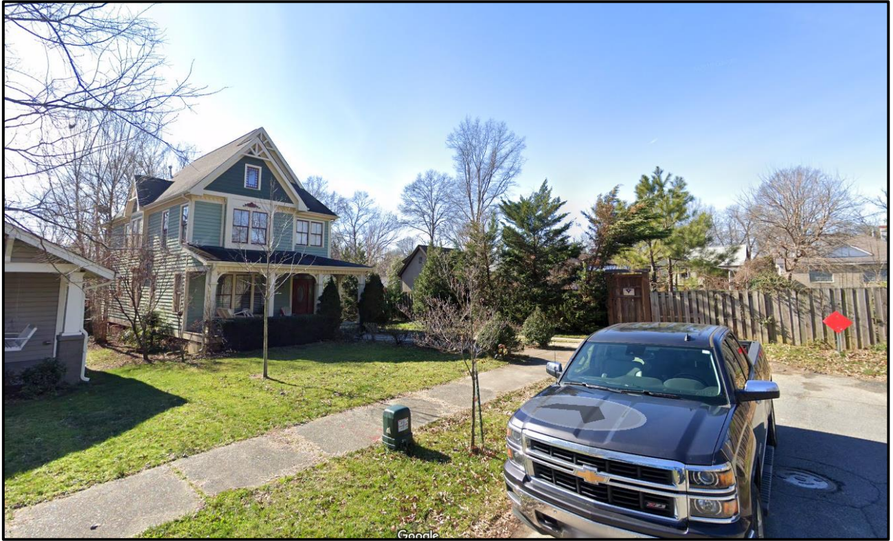
Streetview along Mimosa Avenue. Mimosa Avenue terminates at the southern edge of the subject property.