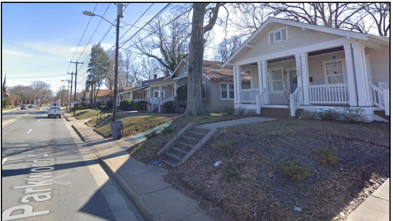
Context of surrounding residential located along Parkwood Ave.