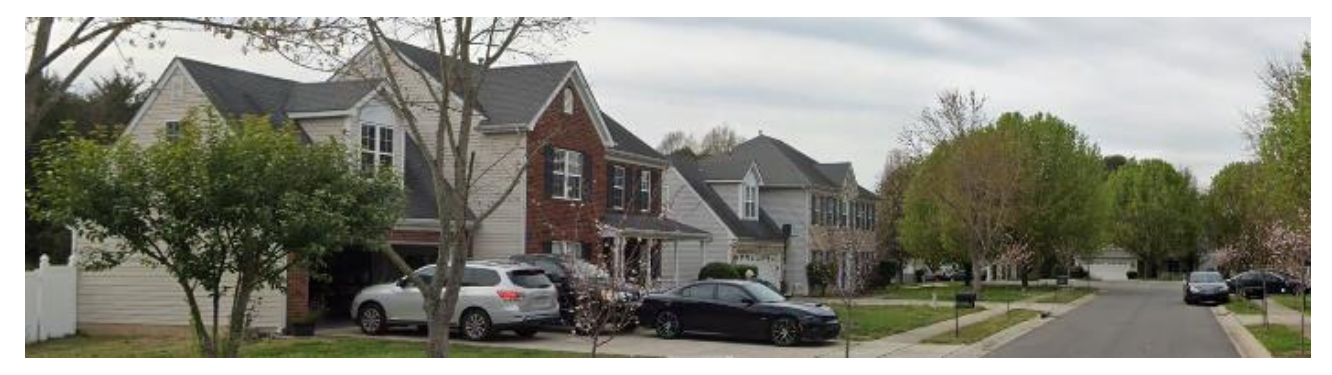
The properties to the east of the site are developed with single family residential uses.