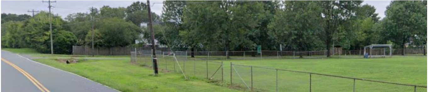
Streetview of recreational and single family residential uses to the west of the site across Choate Circle.