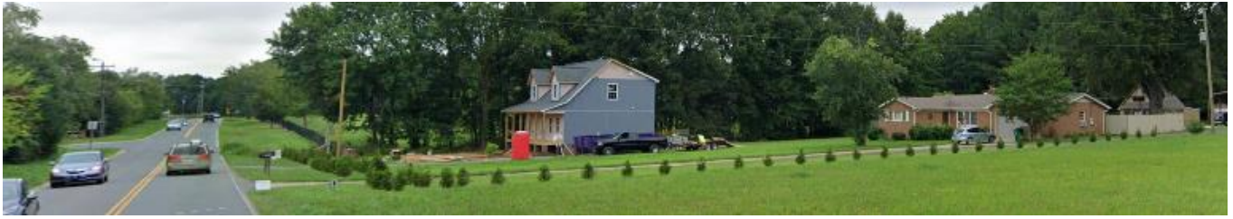
Streetview of large lot single family residential uses to the south of the site along Choate Circle.