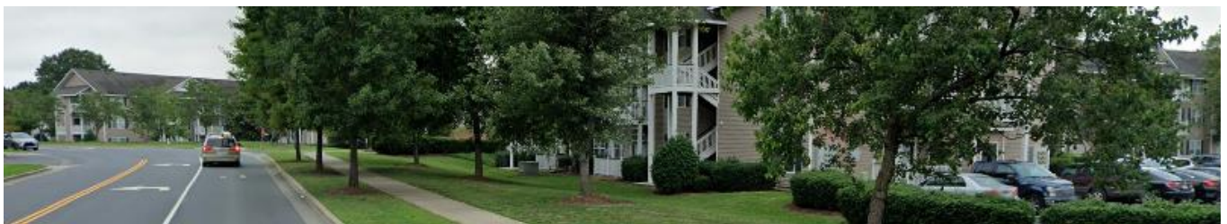
Streetview of multifamily residential uses to the north of the site along Choate Circle.