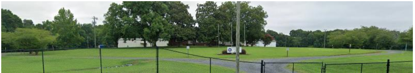
Streetview of the site looking east from Choate Circle. Piedmont Kennel Club currently occupies the site.