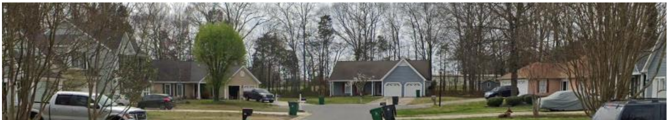
Streetview of single family residential uses to the east of the site along Quixley Lane.