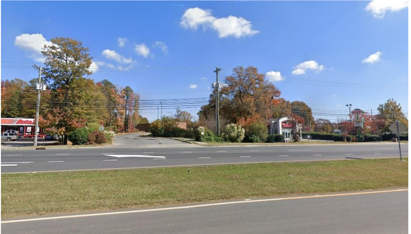
View commercial development located near the intersection of Statesville Road and Old Statesville Road south of the site.