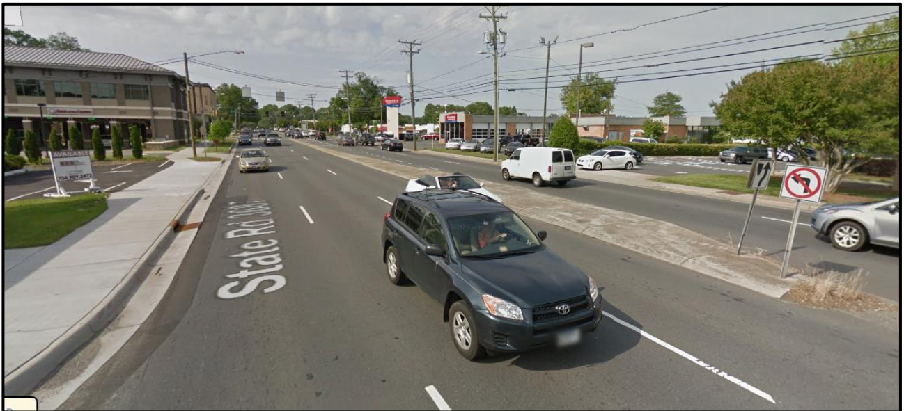
Along Park Road are commercial uses.