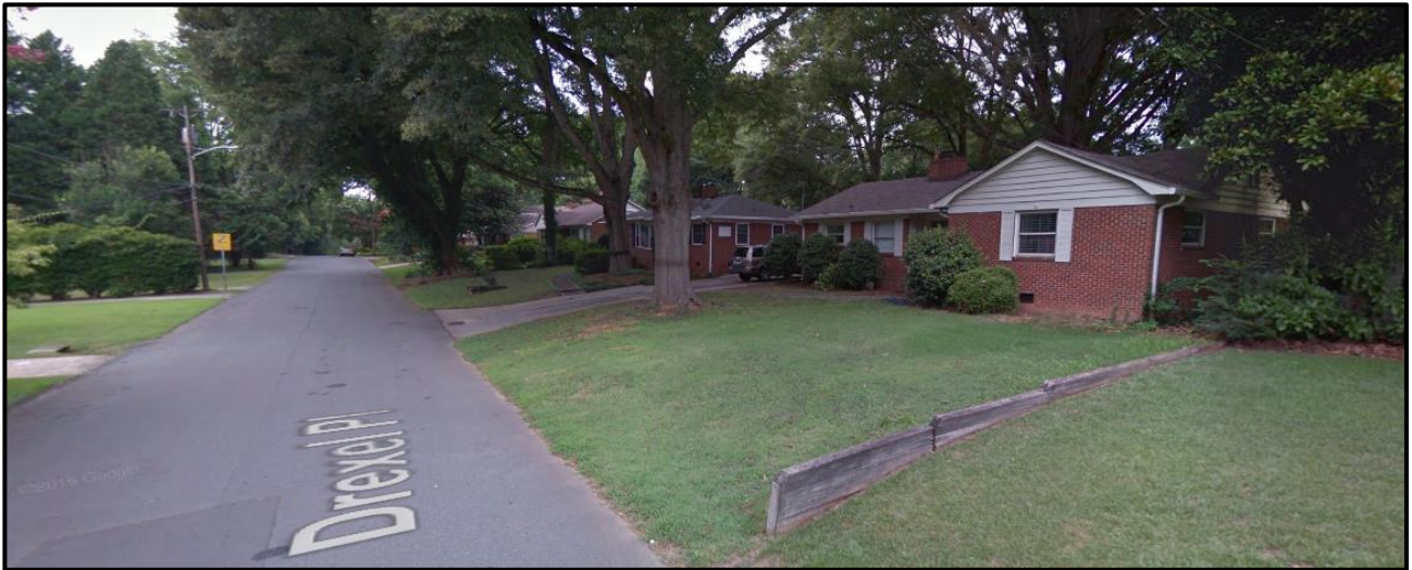
West are single family homes.