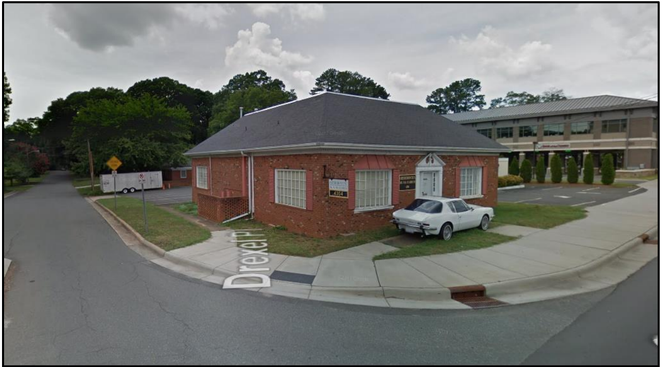
The site is developed with an office building and single-family residence.