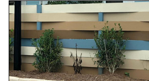
SAMPLE OF FENCE (COLORS T.B.D.)