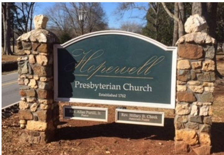
Hopewell Presbyterian Church Sign