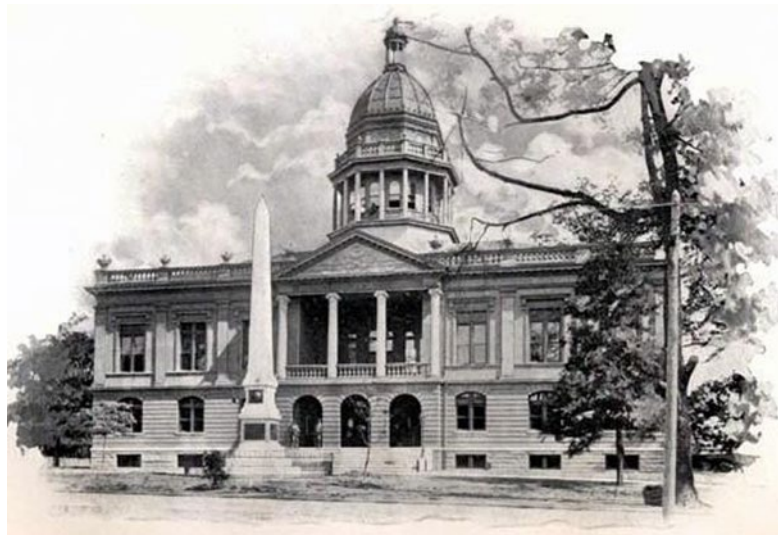
Original Location of Signers' Monument

the signers of the Mecklenburg Declaration of Independence. Dedicated on May 20, 1898, the marker was originally located at the Mecklenburg County Courthouse on South Tryon Street. It now stands in front of the former Courthouse on East Trade Street. 14