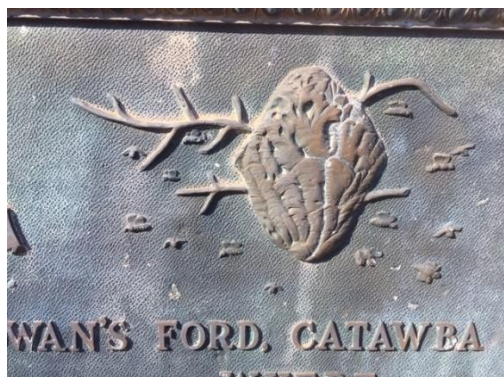
Hornet's Nest on the Cowan's Ford – Davidson College Monument. The Hornet's Nest was the historic Revolutionary War symbol of Mecklenburg County.