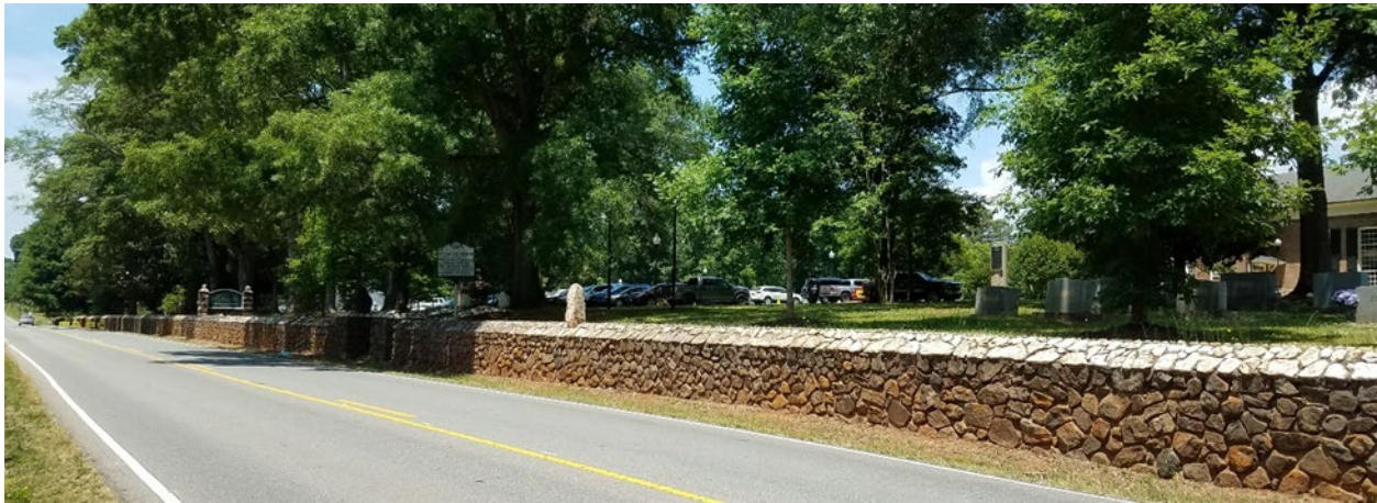
East Wall – Hopewell Presbyterian Church

Baxter Davidson was also responsible for the construction of stone structures at Huntersville's Hopewell Presbyterian Church (10500 Beatties Ford Road), including stone walls lining both sides of Beatties Ford Road (each approximately 500 feet in length), a stone pier marker approximately 6 feet tall identifying the church and its founding date, and a pair of 6-foot-tall stone piers that support an engraved wooden church sign. Those stone structures are prominent landscape features of the Hopewell church property and are already included within a prior designation of the property as a local historic landmark by the Mecklenburg County Board of County Commissioners. 27