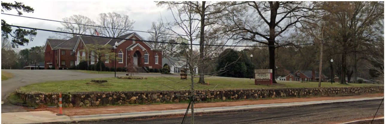
Williams Memorial Presbyterian Church Wall Charlotte