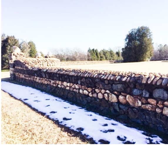
Northwestern Stem leading to Entry Gate of Rural Hill Cemetery

cemetery entrance, consisting of a bronze plaque mounted on a 4.5-foot-tall stone pier of two stacked boulders attached via stonework and mortar to the cemetery wall. Both the wall and the monument are prominent landscape features of the Rural Hill property and are included within a prior designation of Rural Hill as a local historic landmark by the Mecklenburg County Board of County Commissioners. 26