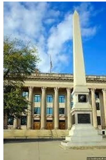
E. Trade St. Location of Signers' Monument