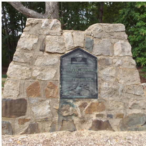
D.A.R. Battle of McIntyre’s Farm monument