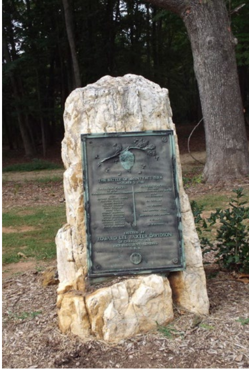
Battle of McIntyre's Farm Monument Charlotte