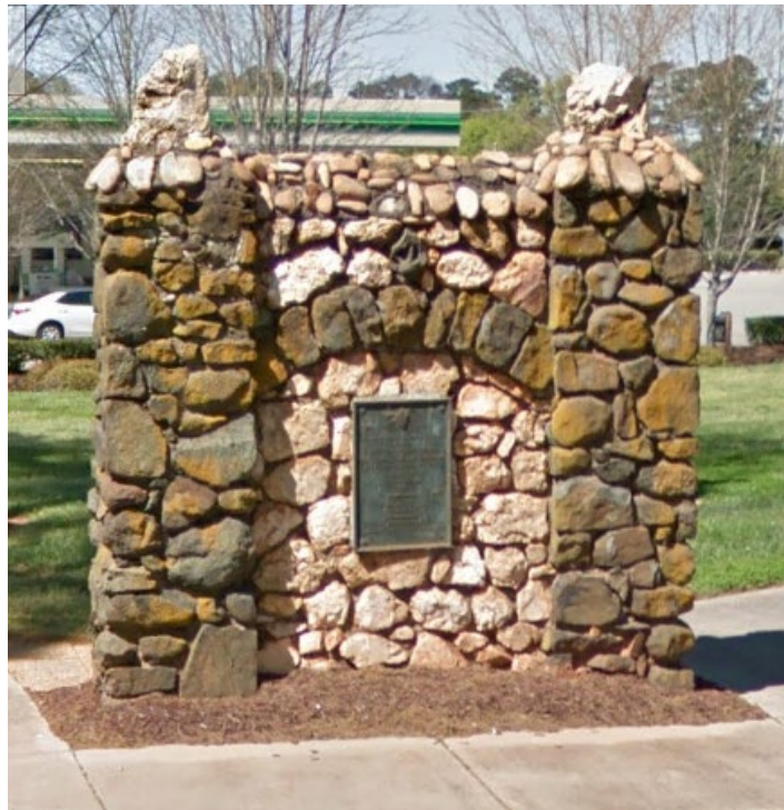
Cowan's Ford – Davidson College Monument Huntersville