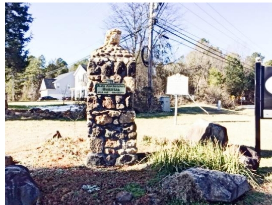
Rural Hill Direction Marker Huntersville