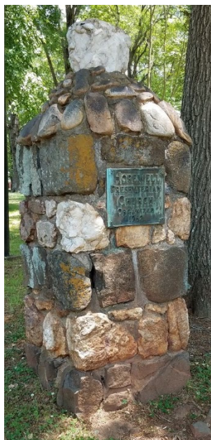
Hopewell Church Marker