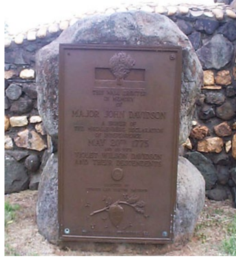
Major John Davidson Marker