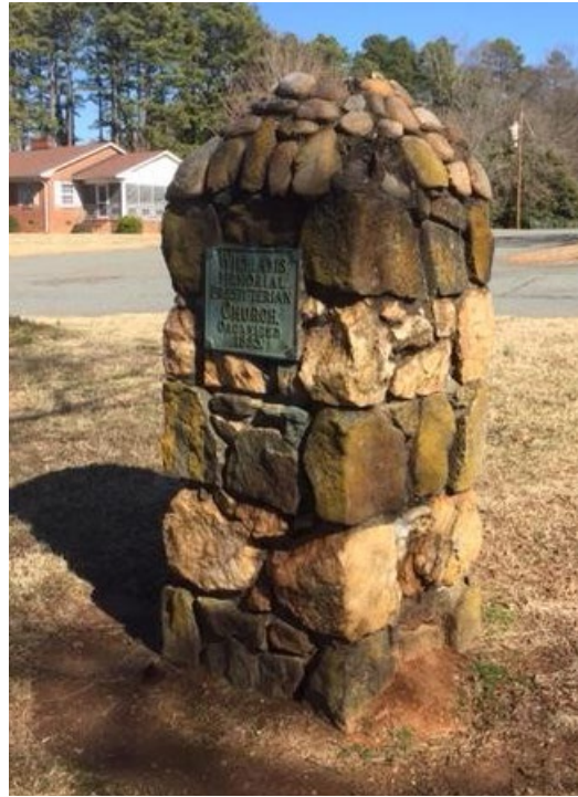
Williams Memorial Presbyterian Church Marker Charlotte