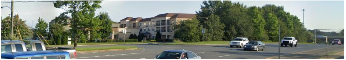
Street view of commercial uses to the north of the site along Little Rock Road.