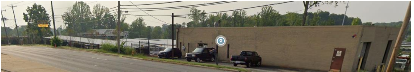
Street view of commercial and industrial uses to the west of the site along Wilkinson Boulevard.