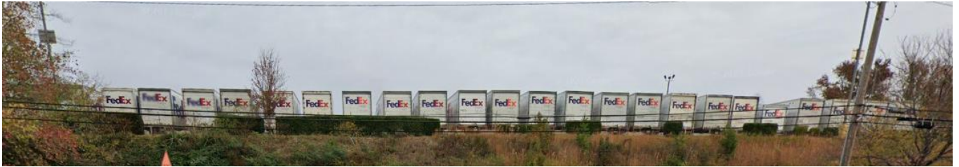
Street view of manufacturing and logistics uses to the east of the site along Wilkinson Boulevard.