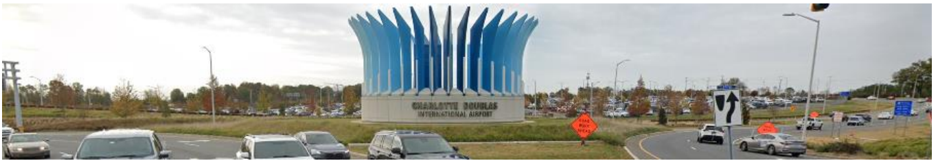
Street view of parking lots associated with Charlotte Douglas International Airport to the south of the site across Wilkinson Boulevard.