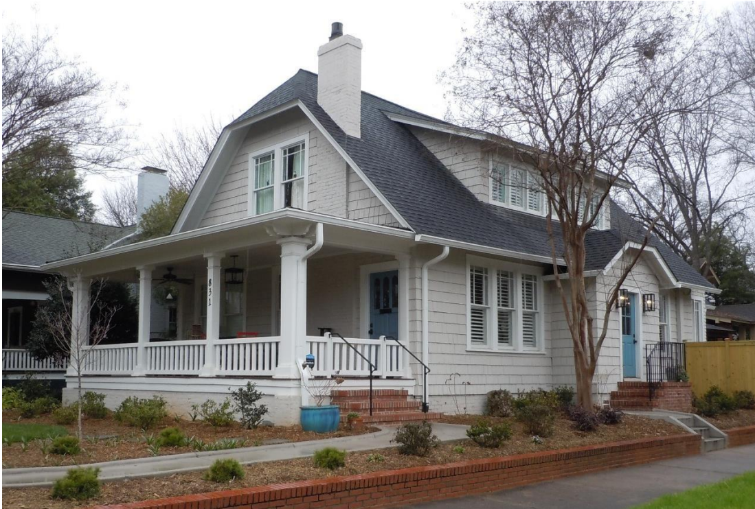
Front and East elevations