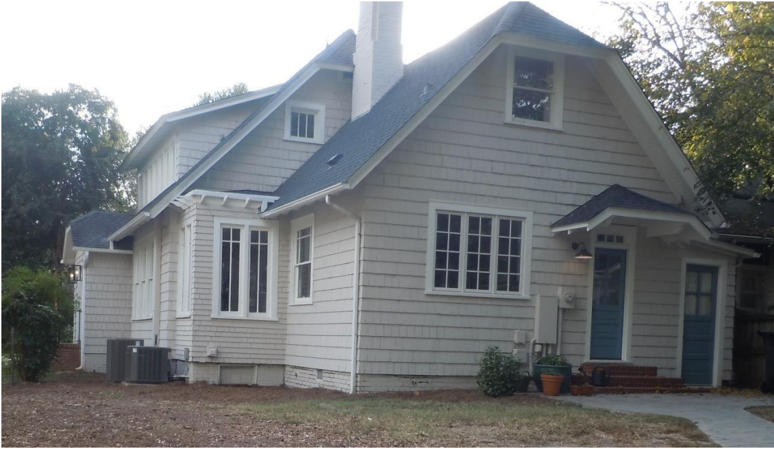
Rear elevation (top); west elevation (bottom)