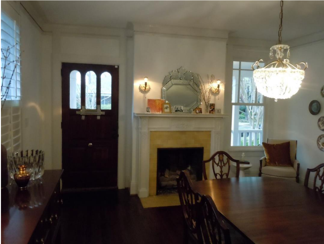
First floor – living/dining room (top, interior view of front door; bottom, from front door)