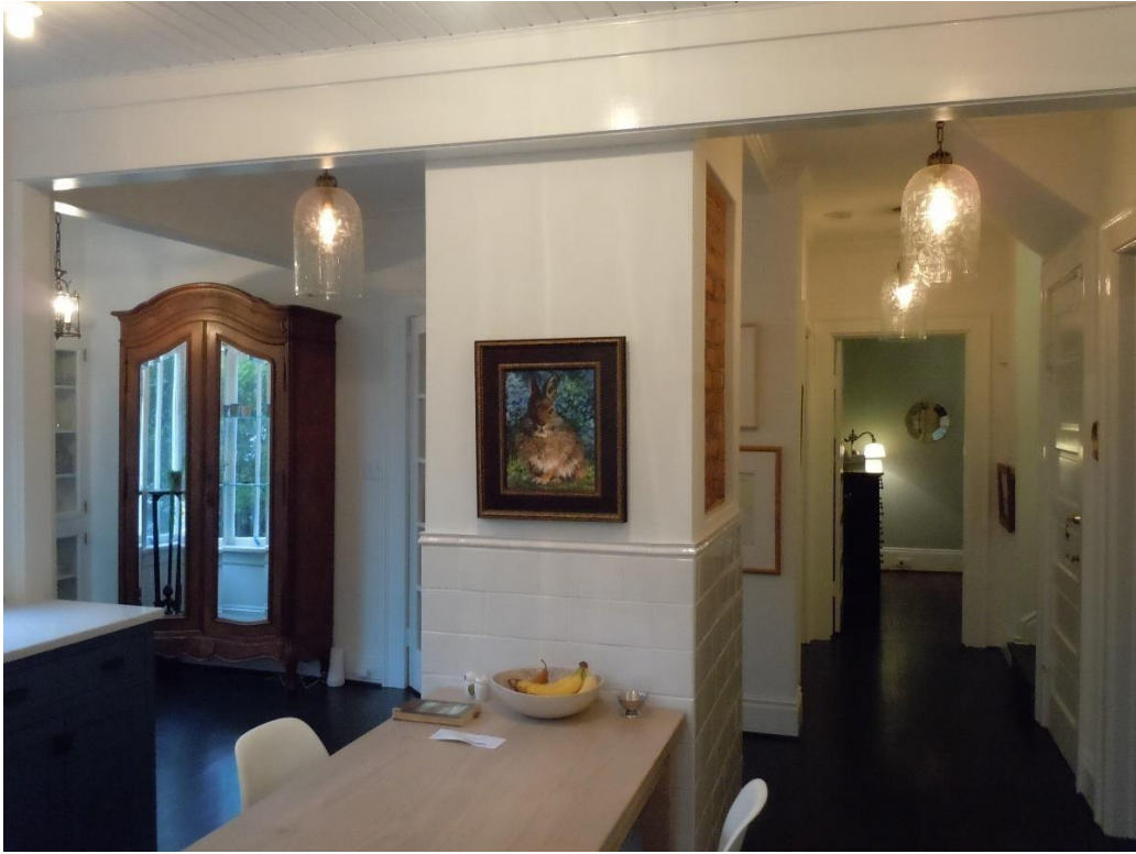
First floor – kitchen (top); second floor – bedroom (bottom)