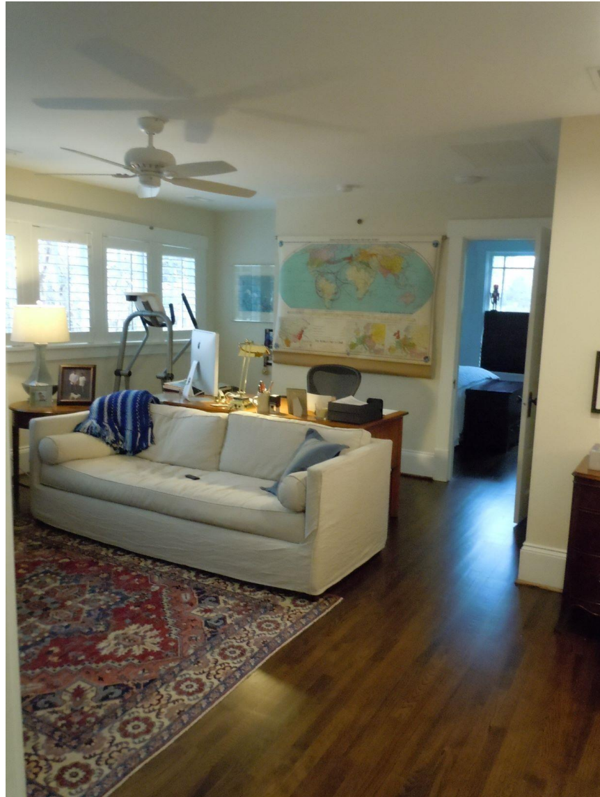
Second floor – den