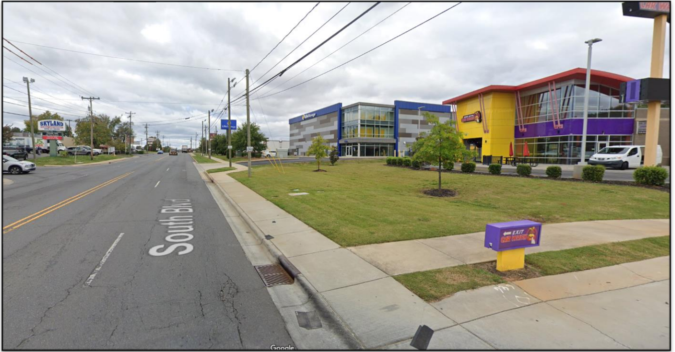
North of the site is a car wash, storage building, restaurants, and car garages.