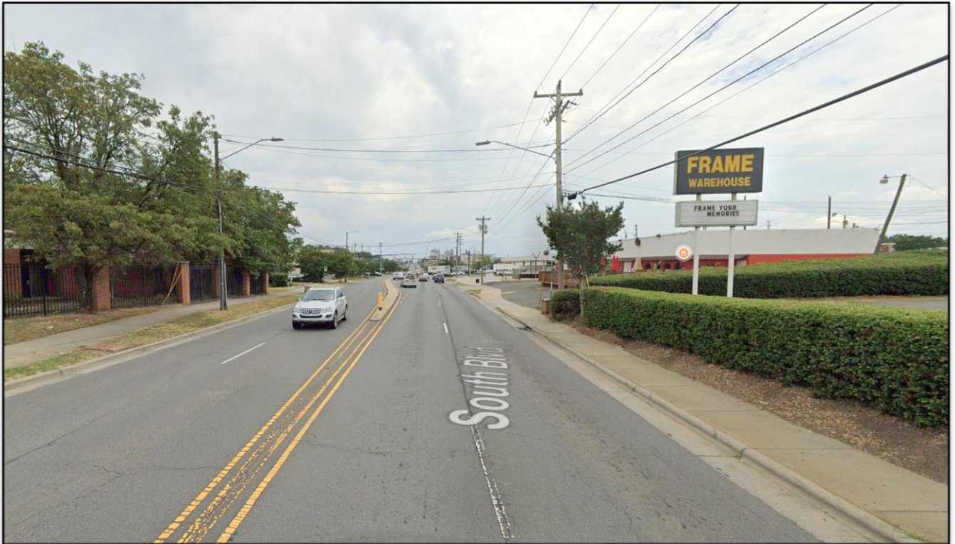
South of the site are retail businesses, restaurants, and a large intersection of South Boulevard and E Woodlawn Road.