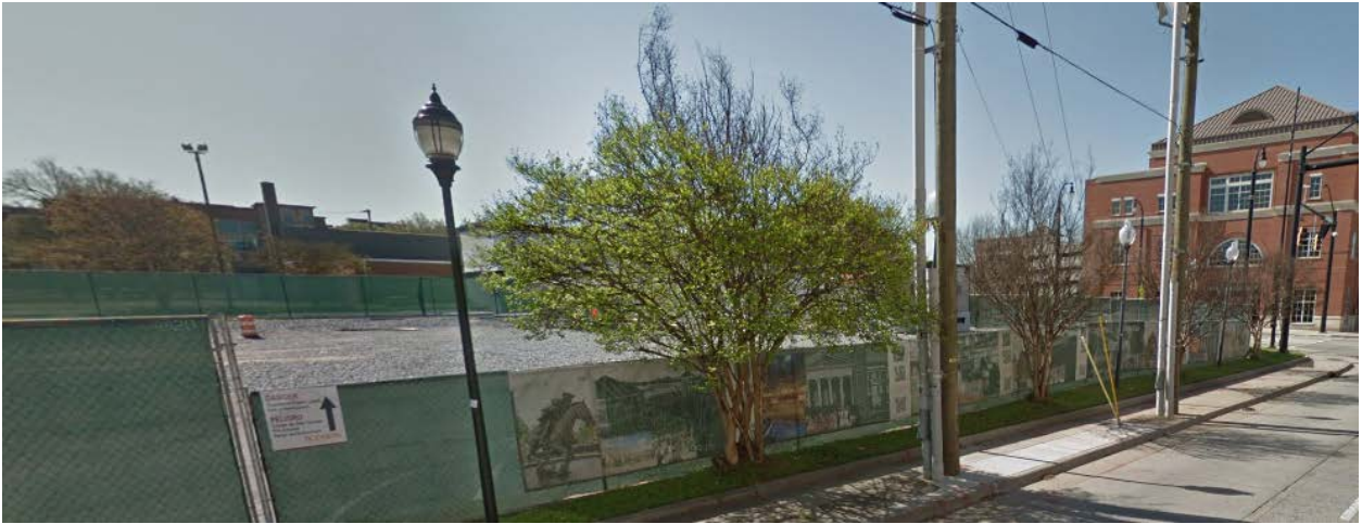
The existing site is developed with retail and office buildings or vacant

use development, optional) and developed with Institutional campus buildings (CPCC), and with various retail and office buildings.