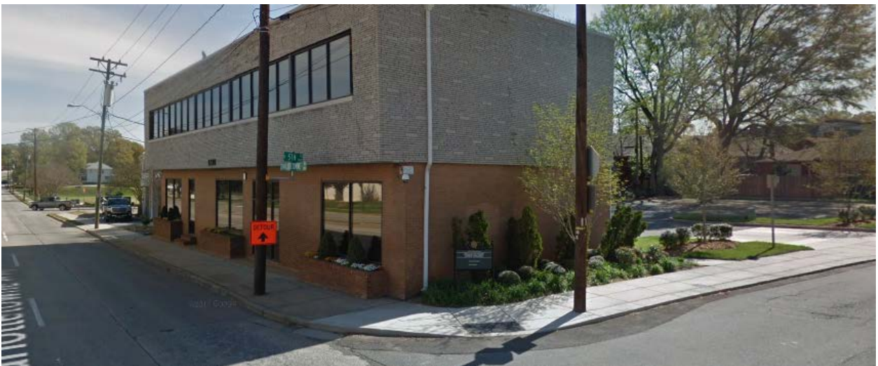
The surrounding properties are developed with institutional campus buildings (CPCC), and with various retail and office buildings.