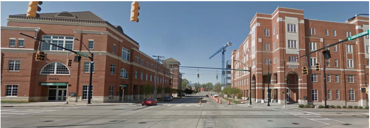
Across Charlottetown Avenue is the CPCC midtown campus.