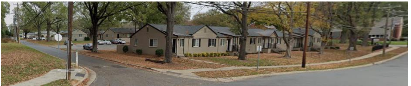
The properties to the east of the site along Greenland Avenue are developed with multifamily residential uses.