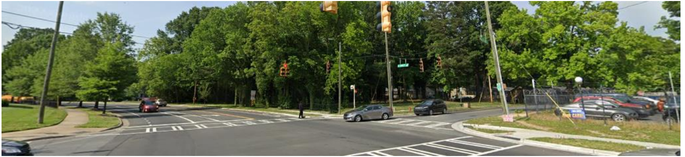
Street view of the site looking northeast from the signalized intersection of Ashley Road and Greenland Avenue.