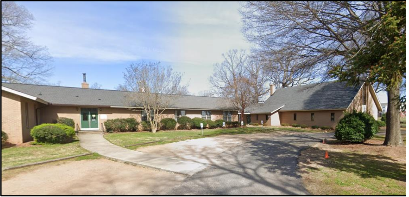
The property to the south is a religious institution and a pre-school.