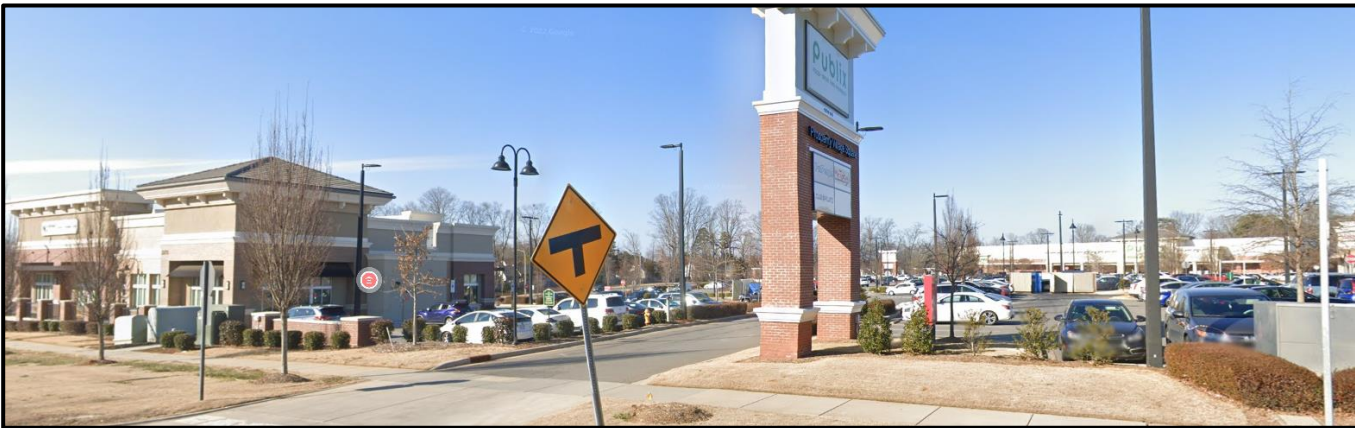
The property to the North along Ridge Road is the Prosperity Village Square shopping center.