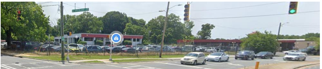
The properties to the south of the site along Ashley Road are developed with commercial uses.