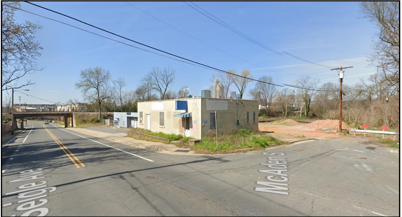
Streetview along Seigle Avenue looking west toward the subject property. A portion of the blue building in the background will be repurposed for retail/office uses.