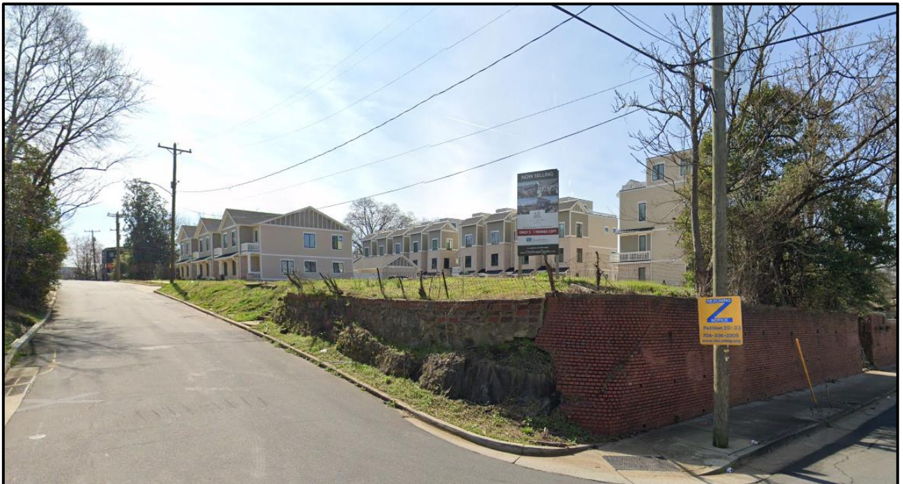
Streetview along Seigle Avenue looking southeast across the street from the subject property. Recent rezoning at this site has resulted in the construction of a new townhome community at this location.