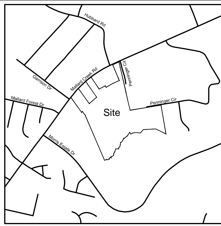
Vicinity Map n.t.s