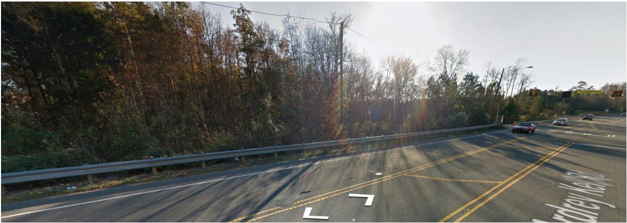
West of the site is a stream buffer along a tributary of Six Mile Creek. Across the creek is single family development.