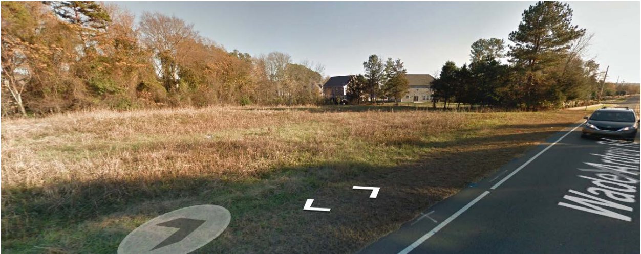
East of the site, across Wade Ardrey Road is a vacant parcel and single family development.