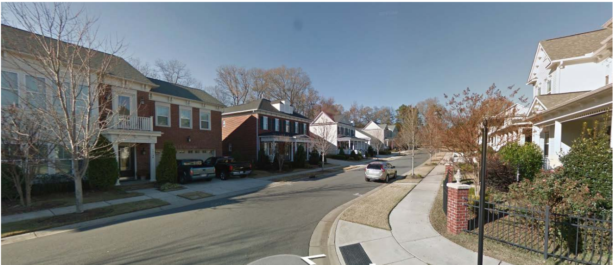
South of the site is a residential development containing a mixture of single family homes and townhomes.