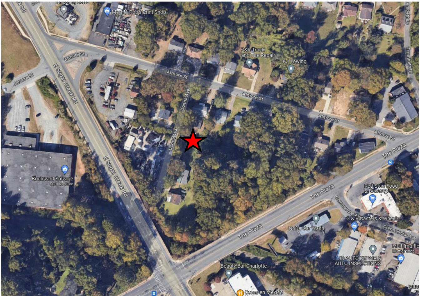
Provide birds eye caption that includes general summary of surrounding land use in area. (surrounding land use).