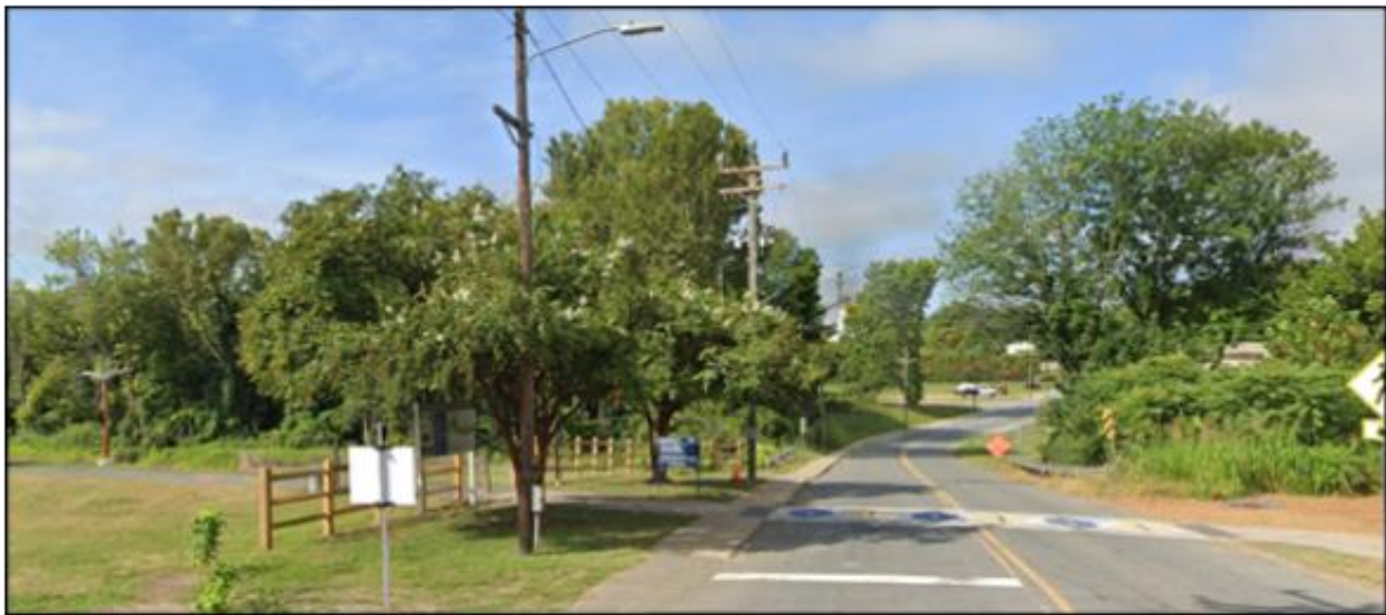
West of the site is the greenway entrance.