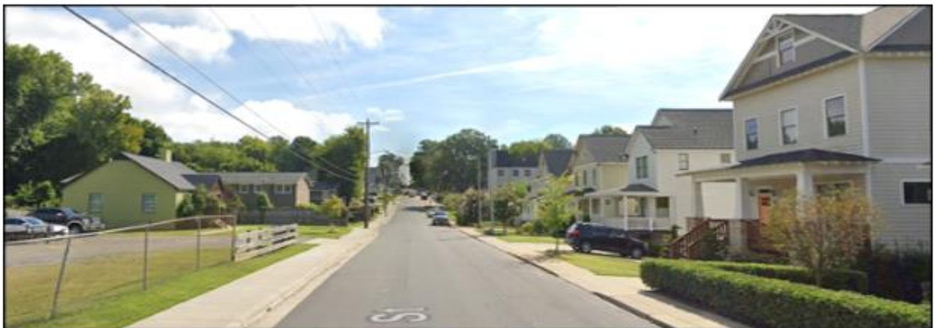
East of the site are single family homes.