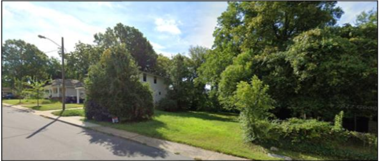
The site is currently vacant.