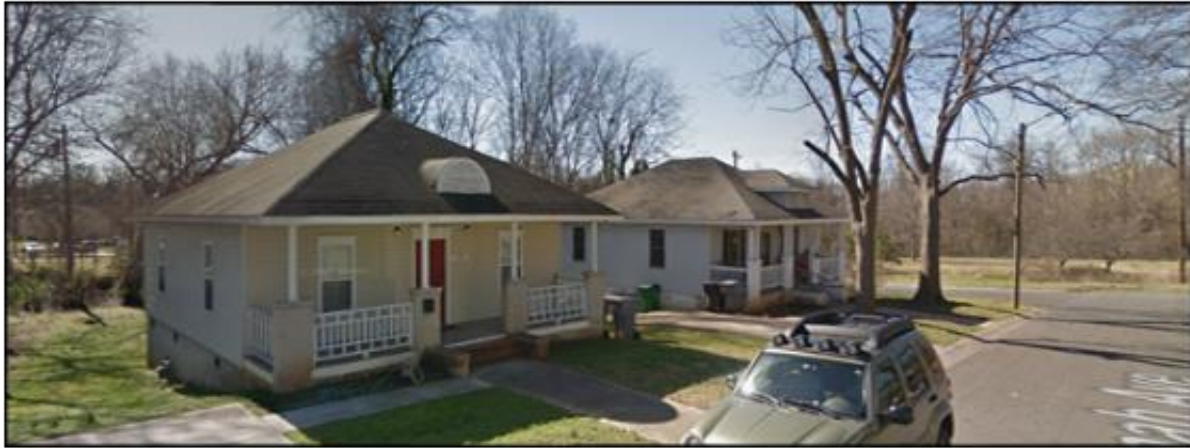
South of the site are single family homes.