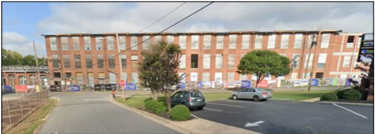
North of the site is the Savona Mill development with unleased retail space and occupied multi-family housing.