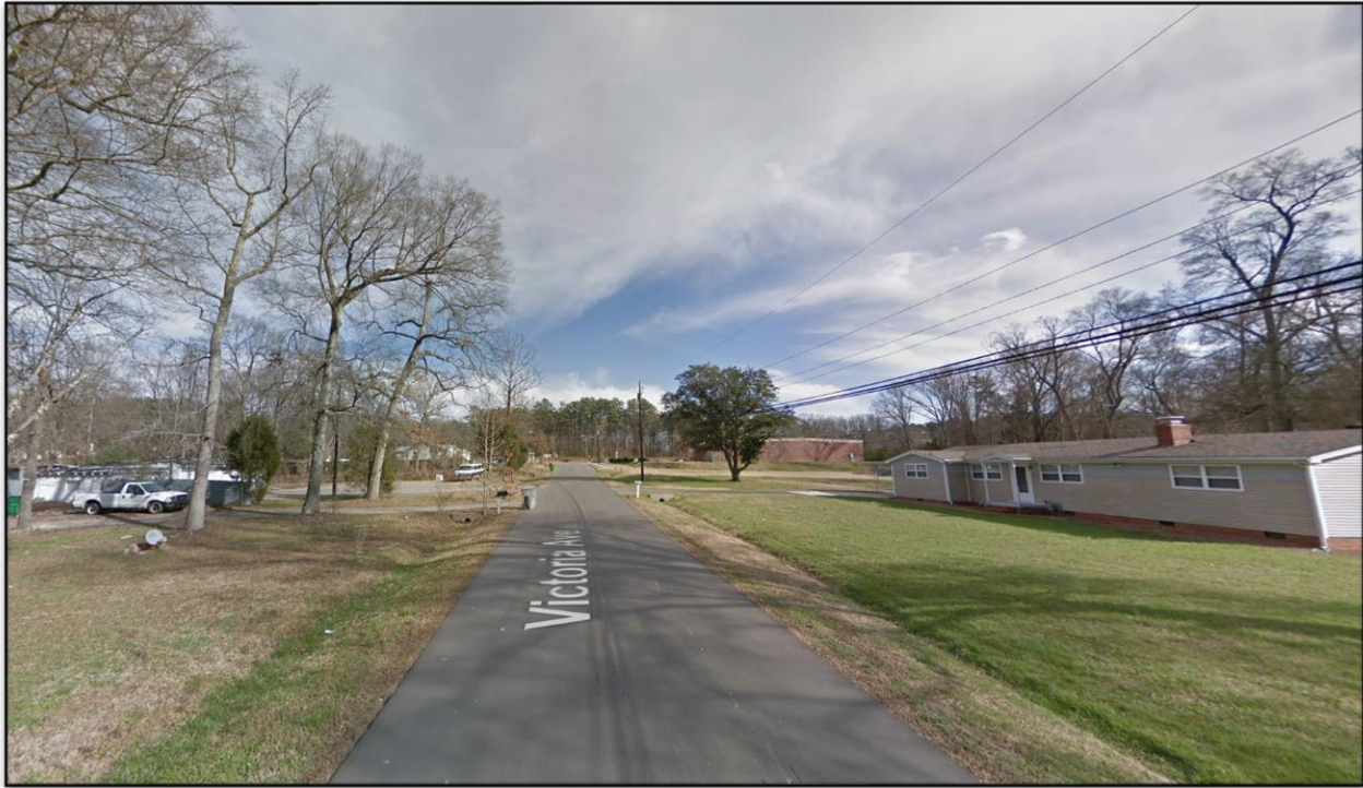
East of the site are manufactured homes.