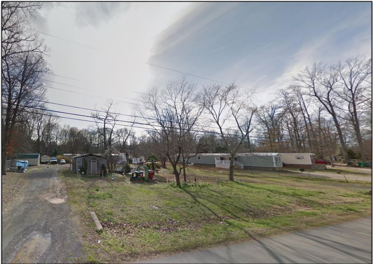
South of the site are manufactured homes.