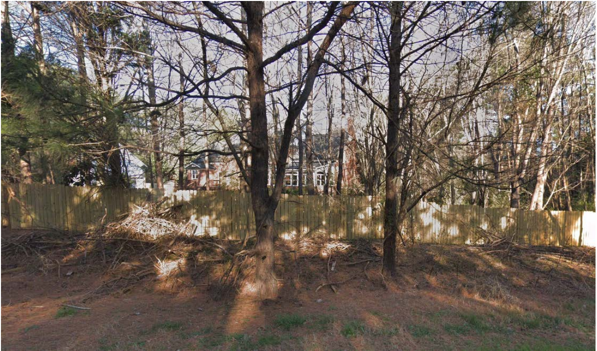
Properties north and west of the site, across McKee Road are developed with single family homes.