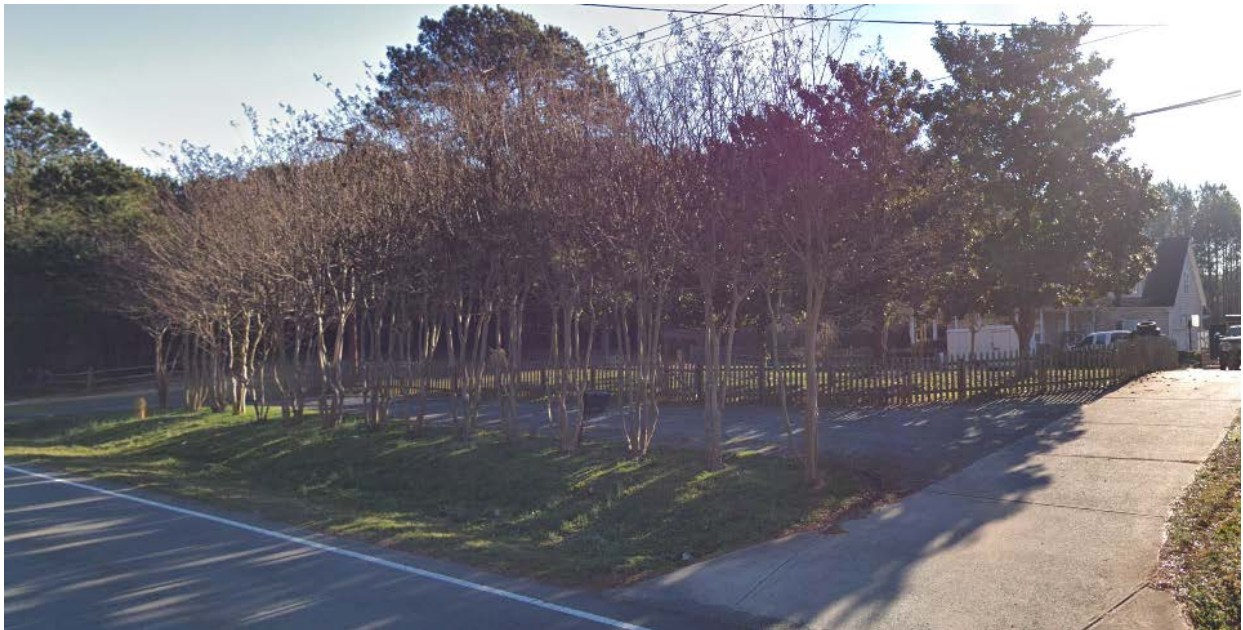
The site is composed of a single family home and vacant land.