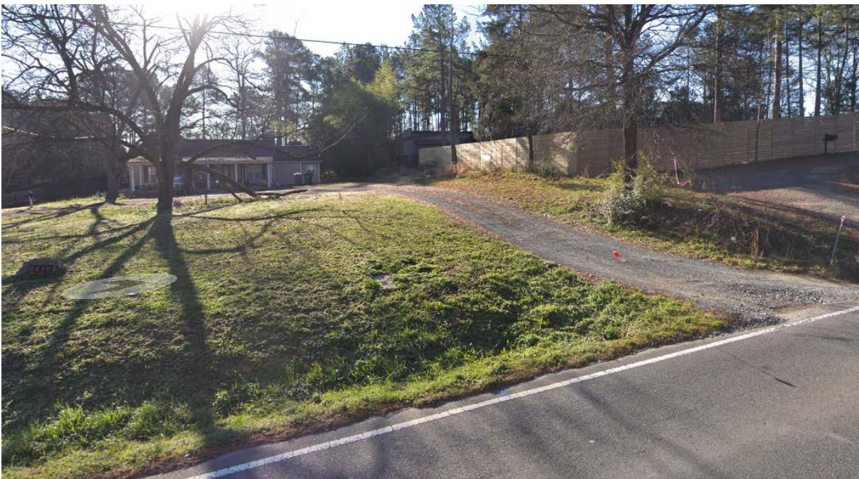
Properties to the south are developed with single family homes.