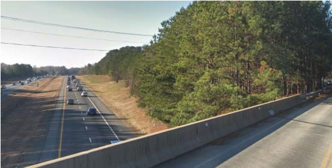
East of the site is Interstate 485.