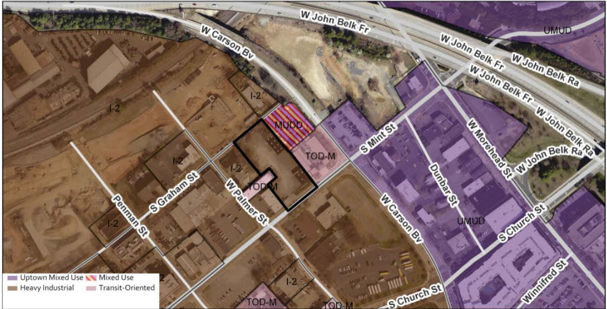
The subject property is zoned I-2 (general industrial) and is developed with a warehouse/office use.