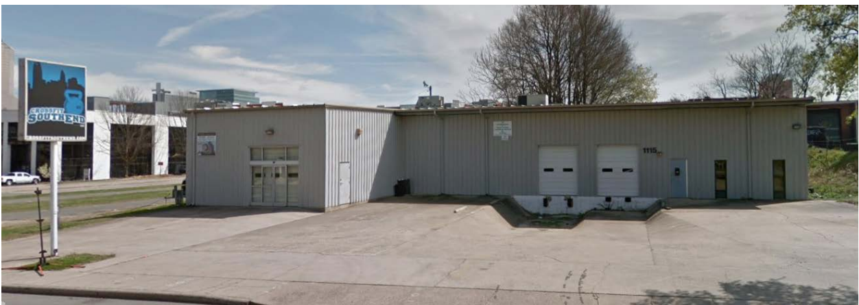
The property to the east has been readapted into a sports gym.