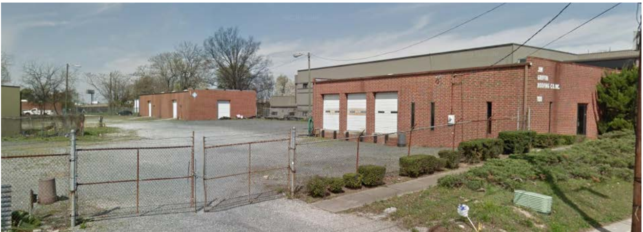
The subject property is developed with a warehouse/office use.