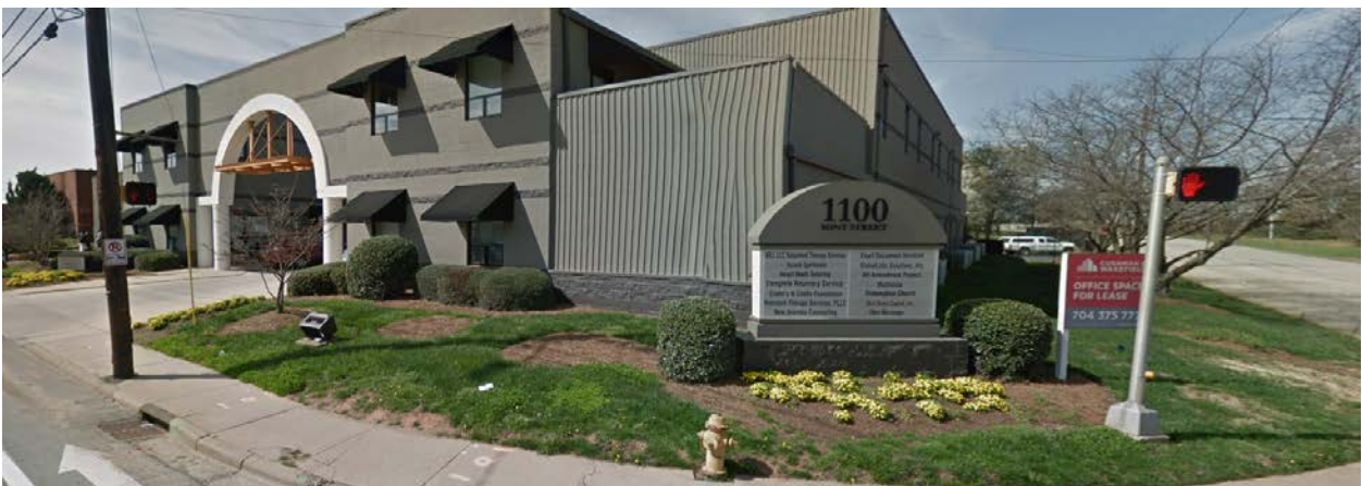
Properties to the north are developed with office and retail uses.