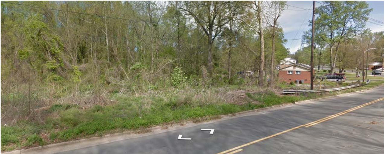
Subject property is vacant with single family residential homes to the east, along West Craighead Road.