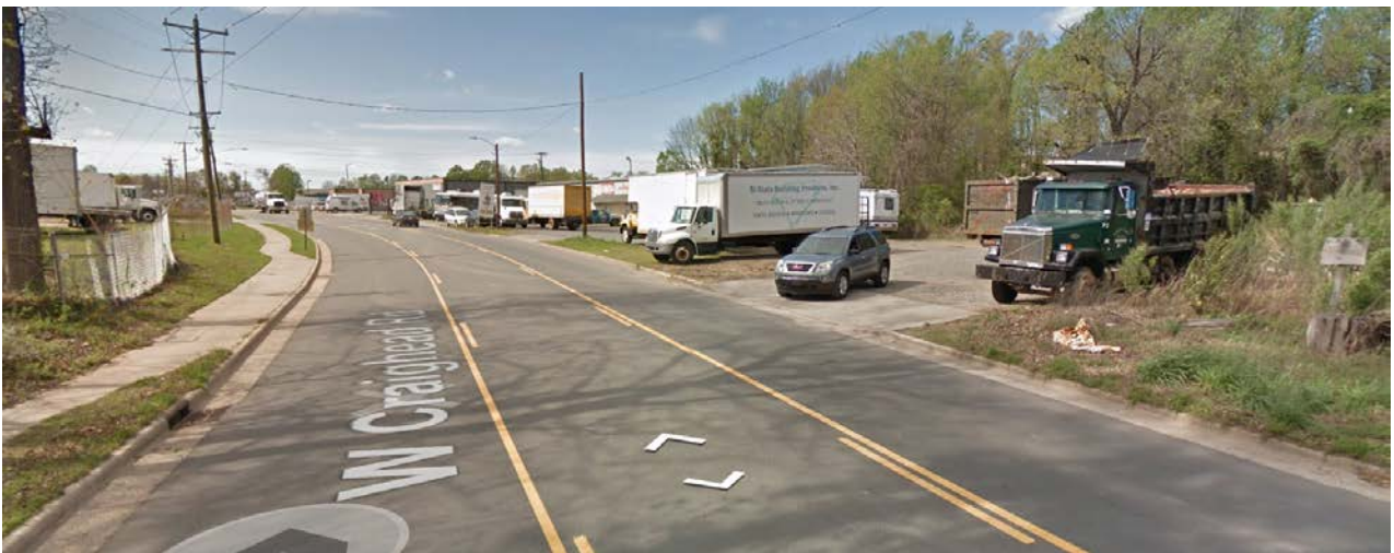
Industrial uses front Craighead Road west of the site.