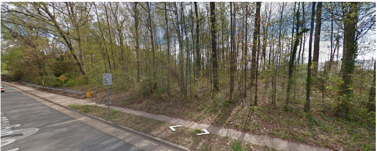
South of the site, across Craighead Road is property owned by Mecklenburg County for Derita Creek Community Park.