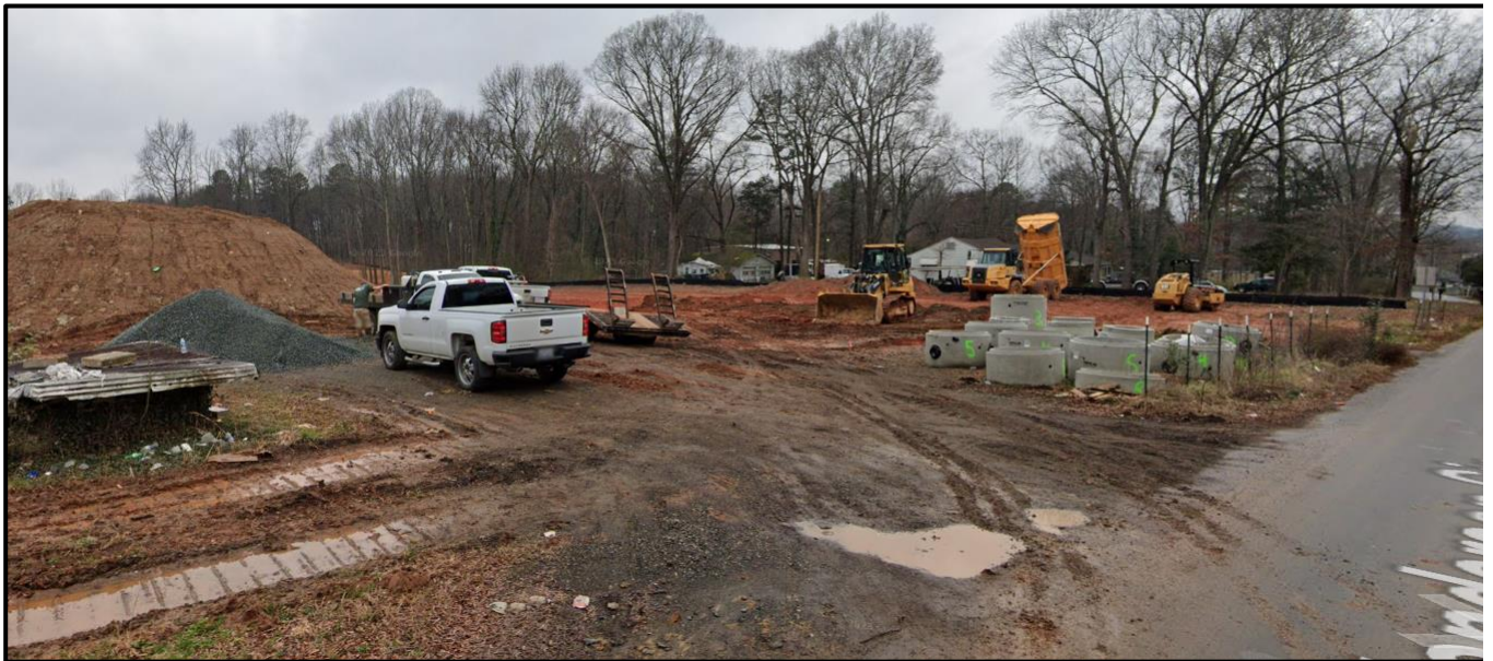
The property to the south is under construction with a single family subdivision.