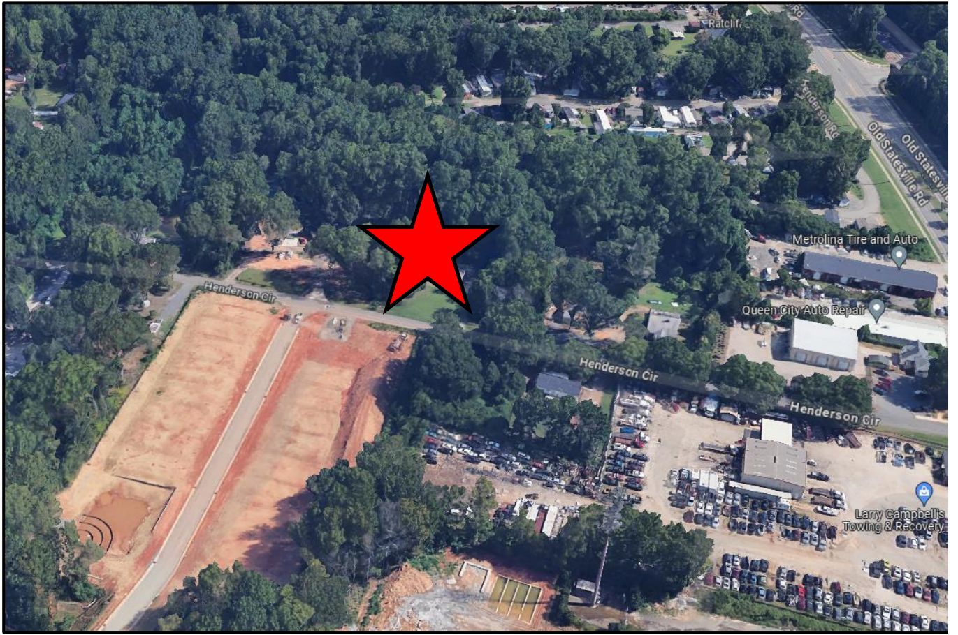
The subject property is denoted with a red star.