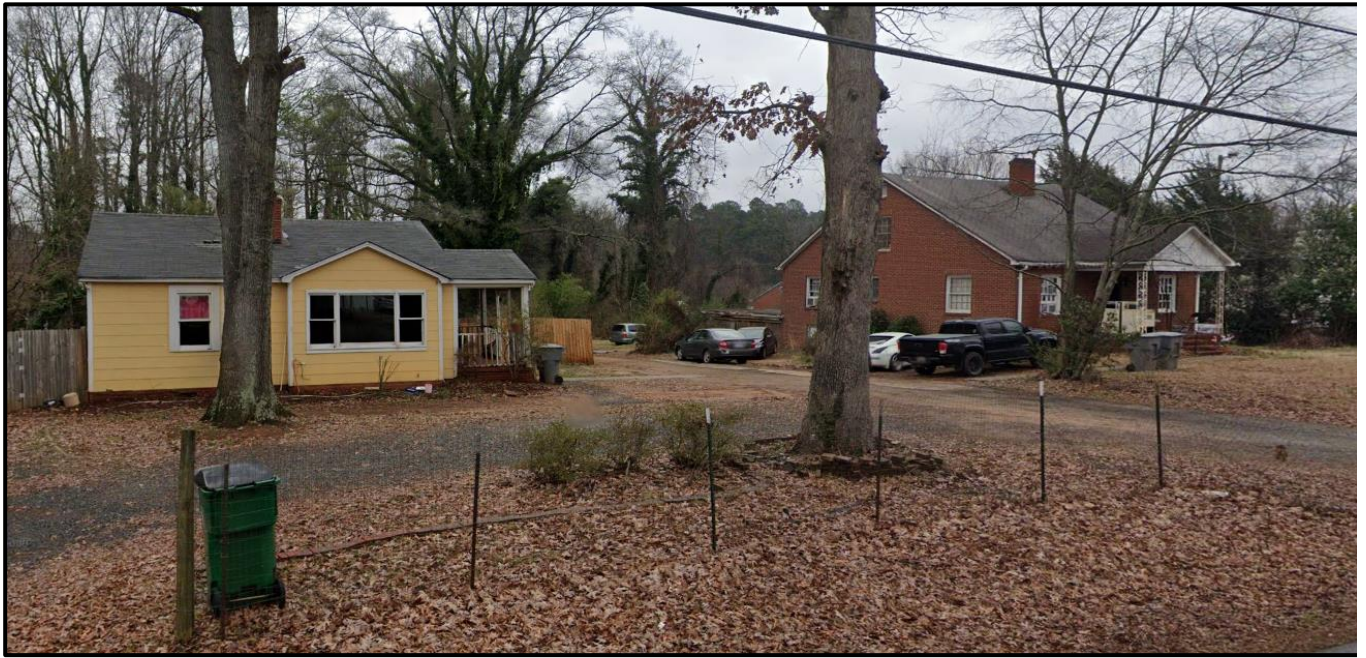
The property to the east along Henderson Circle is developed with single family homes.