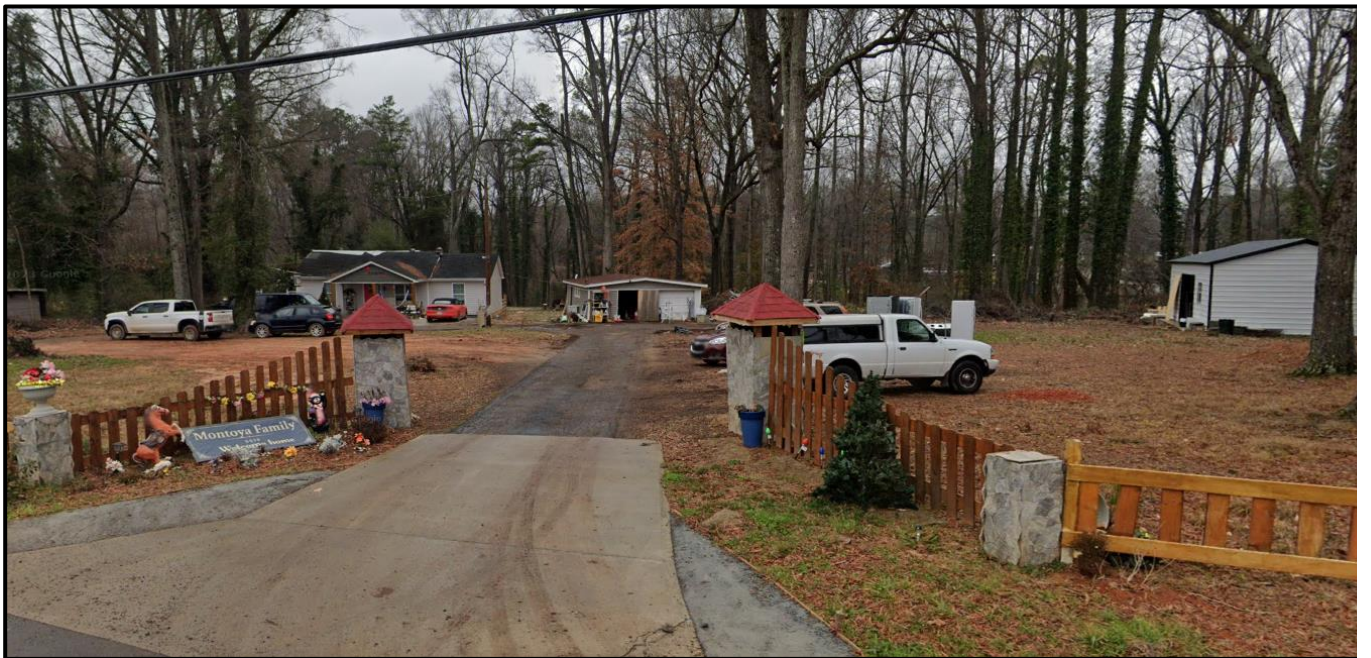
The property to the west along Henderson Circle is developed with a single family home.