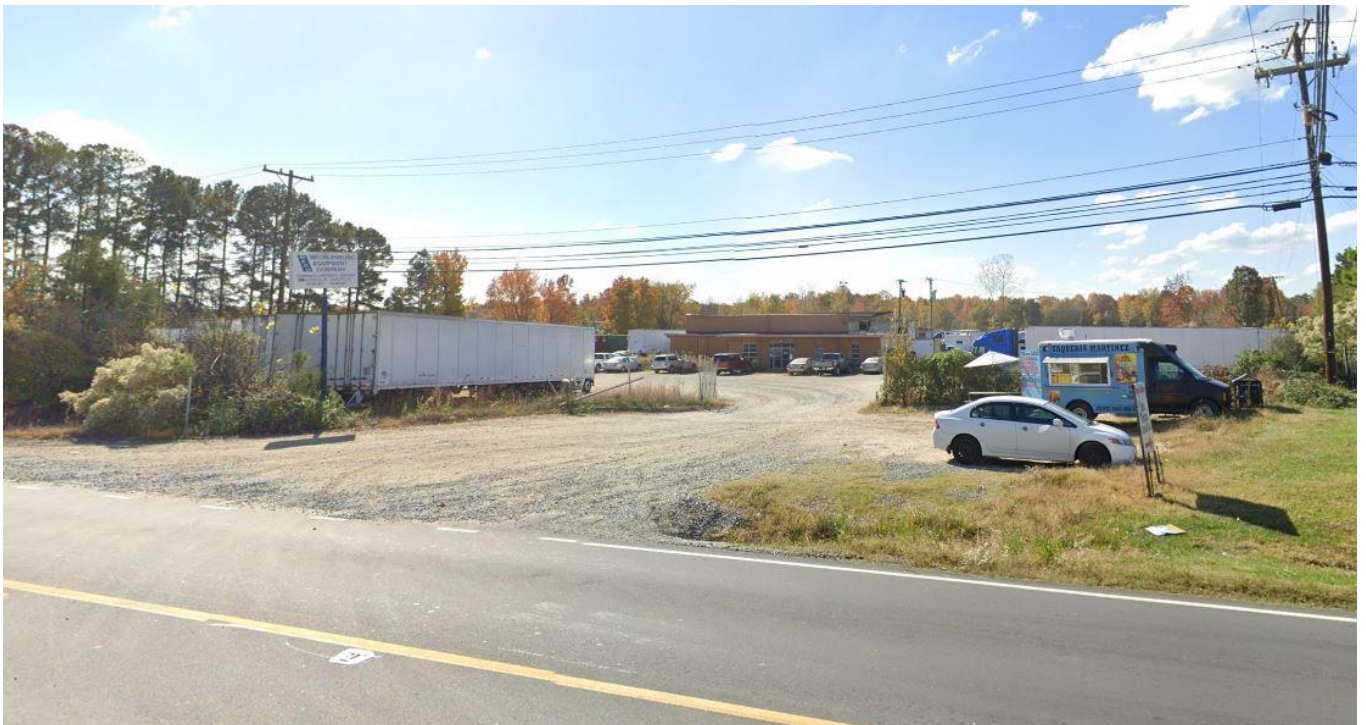
View of an older warehousing/industrial development on the west side of Statesville Road typical of the development pattern in the area.