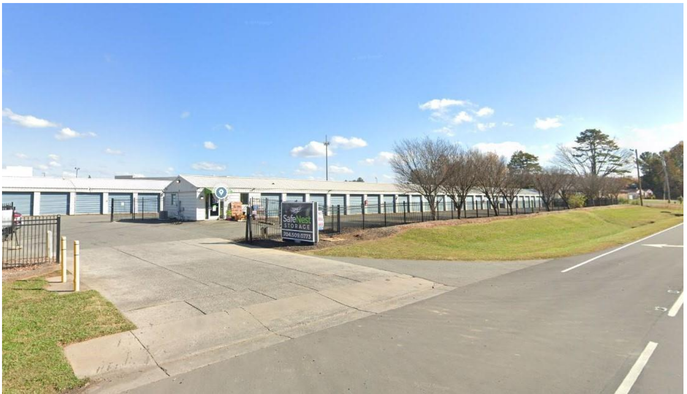
View of the site looking east from the Statesville Road. The property is currently developed with a self-storage facility.