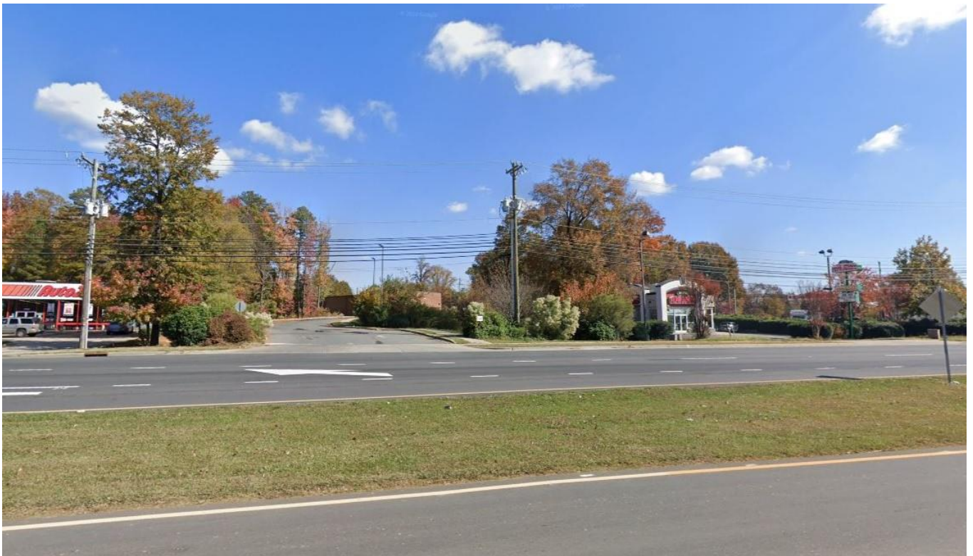
View commercial development located near the intersection of Statesville Road and Old Statesville Road south of the site.