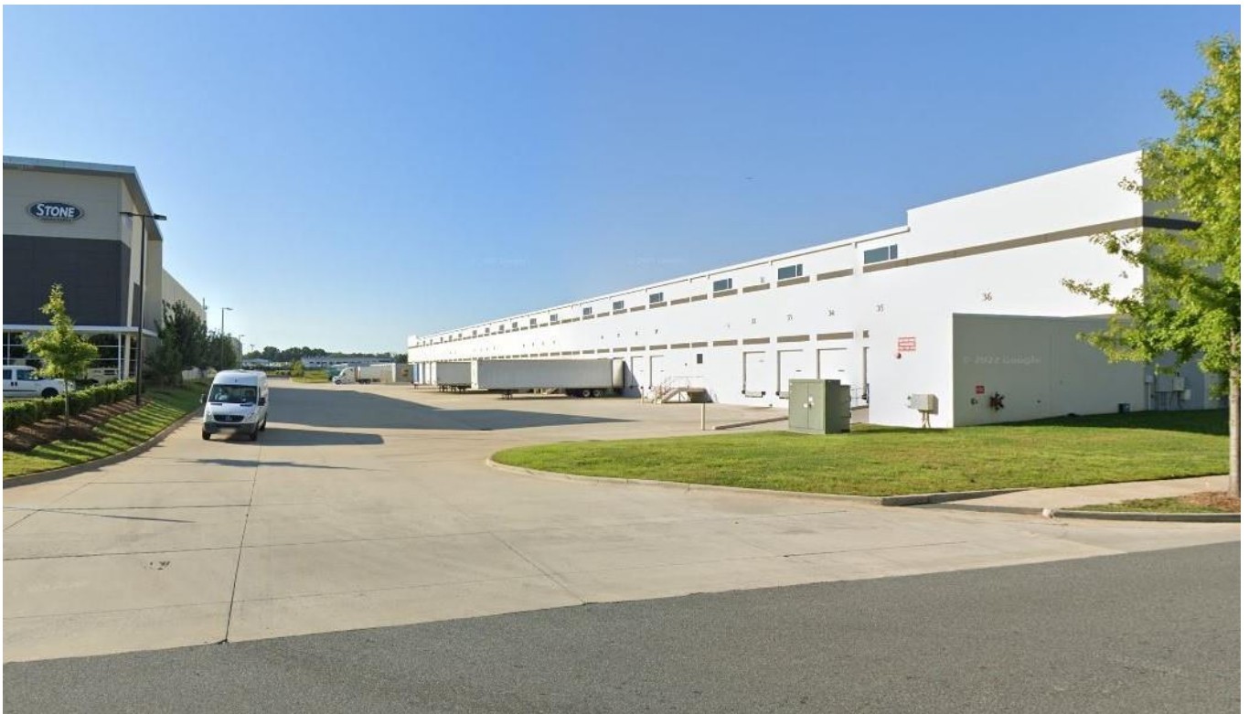
View of a newer warehousing/industrial development north of the site off Statesville Road.