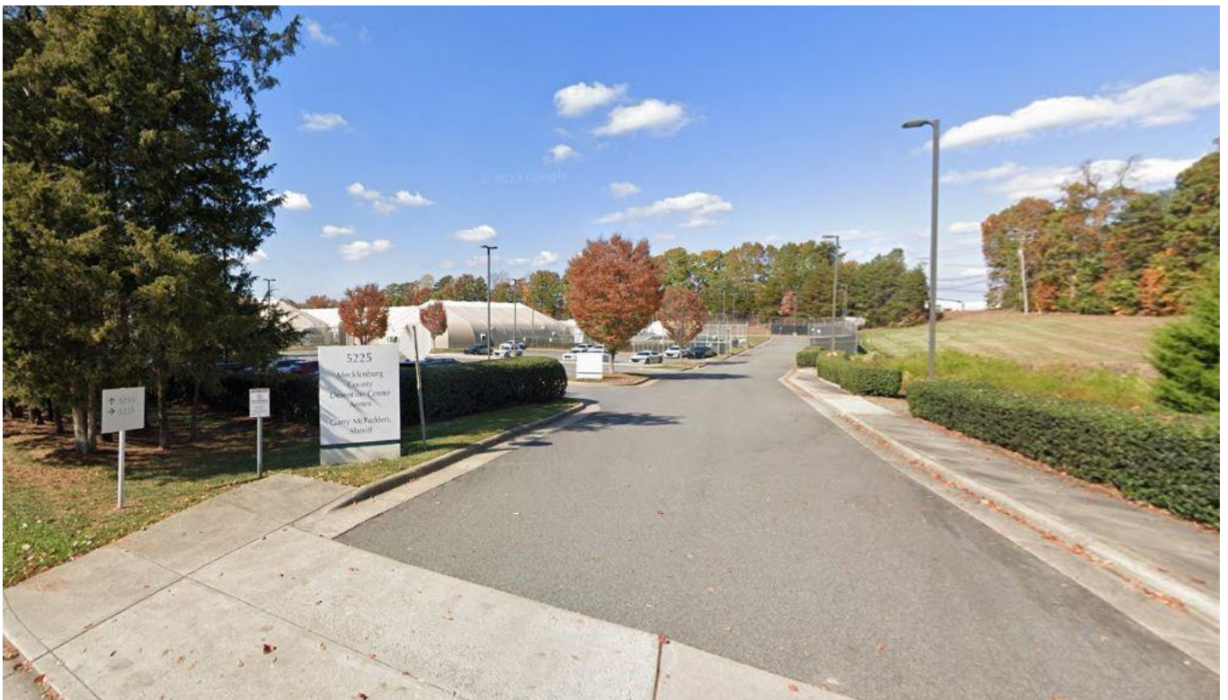
View of a Mecklenburg County correctional facility located on Statesville Road west of the site.