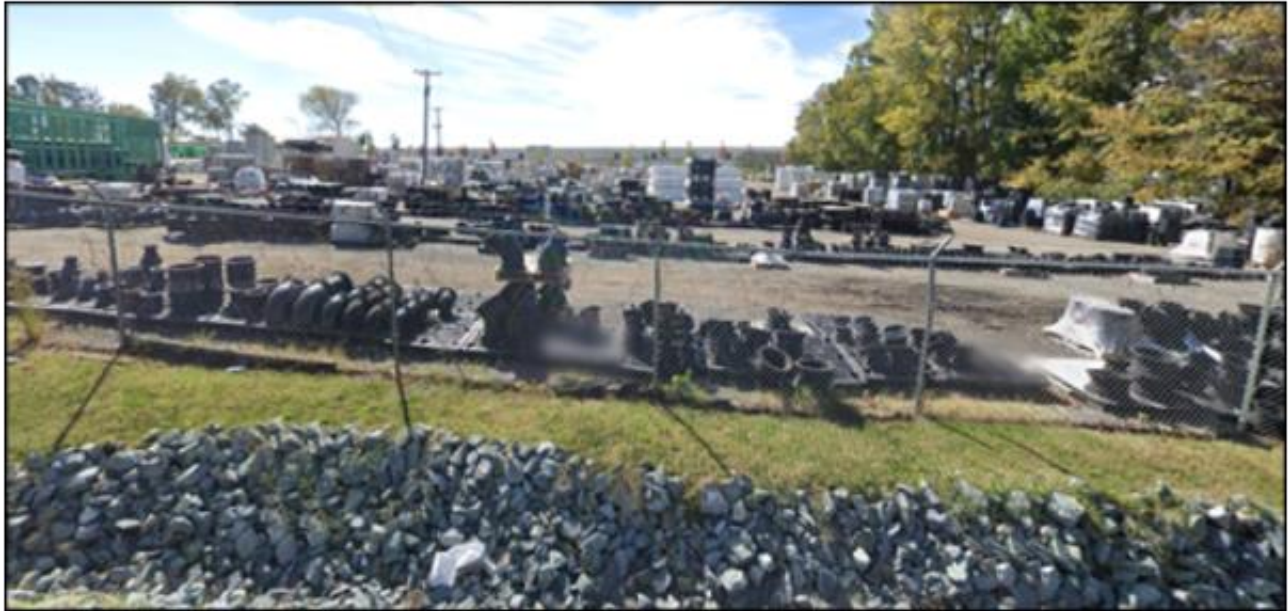
North of the site is a Water works equipment supplier