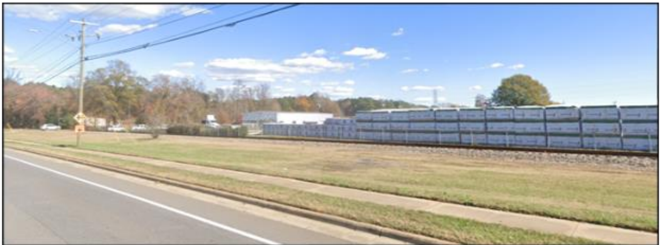
East of the site is a building materials store.