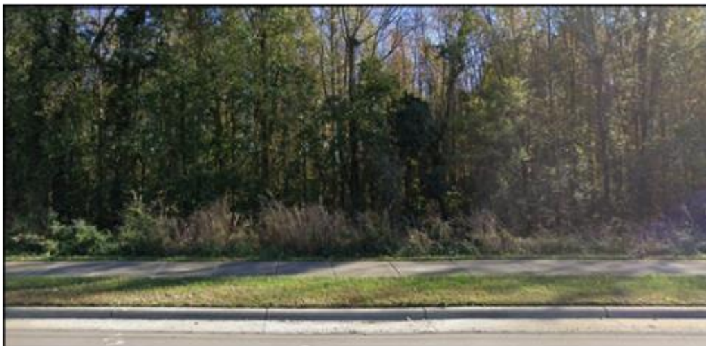
South of the site is a vacant lot.