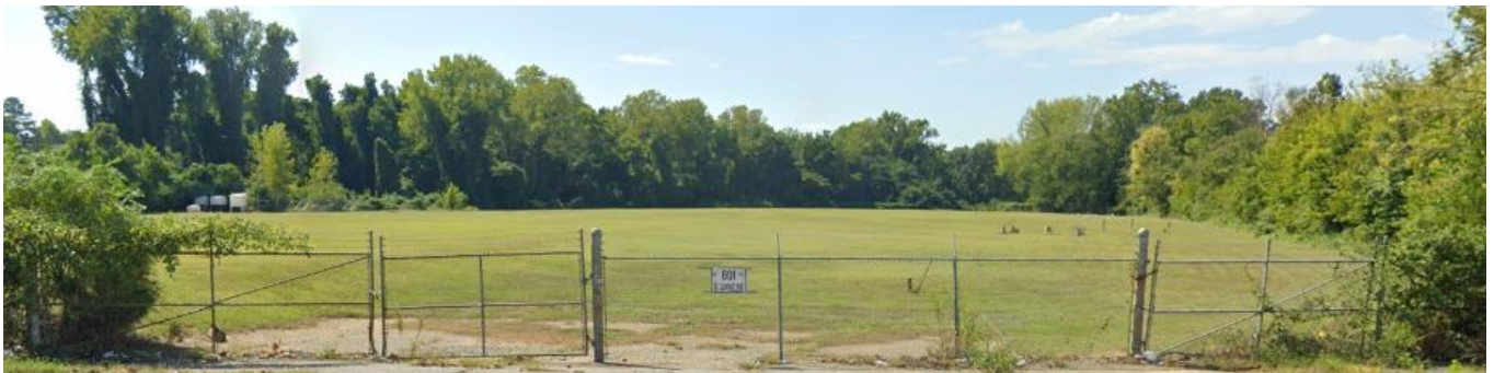
Street view of vacant property to the south of the site as seen from W Summit Avenue.