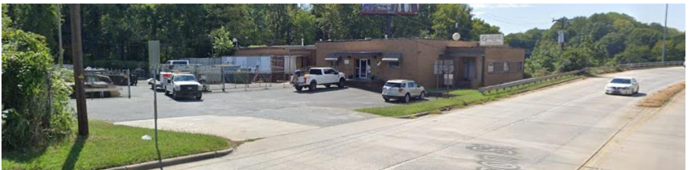
Street view of industrial use to the west of the site along S Clarkson Street.