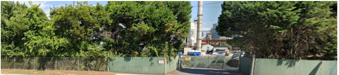
Street view of the former Charlotte Pipe & Foundry campus to the east of the site across W Summit Avenue.