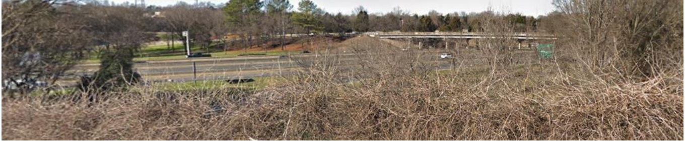
Street view of the I-77 & I-277 interchange north of the site as seen from S Clarkson Street.