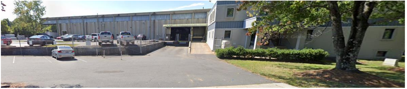
Street view of the site as seen from W Summit Avenue. The site is developed with warehouse-style buildings.