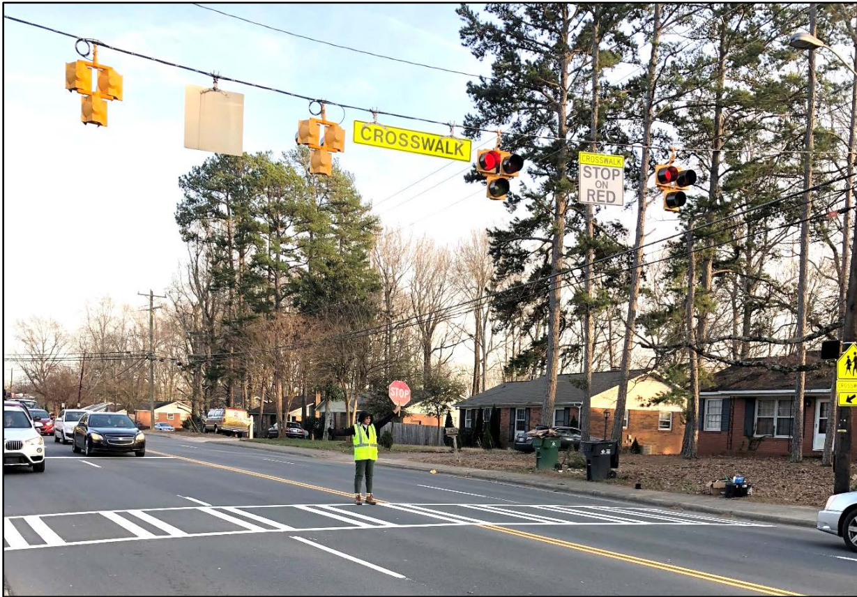
Figure 3: Crossing Guard at Idlewild Elementary School