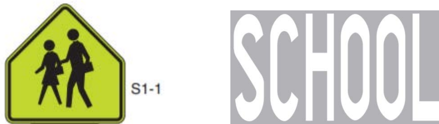
Figure 2: MUTCD School Sign and Pavement Marking Legend

The portion of the roadway located within three hundred (300) feet of a school's property line. This includes streets that directly front or are adjacent to the school's main access. School zones are identified with a school sign (MUTCD S1-1) and "SCHOOL" pavement marking legend as shown in Figure 2.