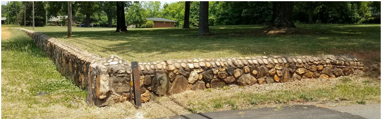
Northern Entrance to Williams Memorial Presbyterian Church Property Looking Toward Northern Terminus of Wall

In form and execution, the Williams Memorial wall is the least refined of the stone structures erected by E. L. Baxter Davidson in north Mecklenburg County. In comparison, the walls he provided for Huntersville's Hopewell Presbyterian Church span both sides of Beatties Ford Road and are longer (approximately 1,000 feet long on the eastern side of Beatties Ford Road and approximately 830 feet long on the western side), taller (ranging from 5 to 6 feet tall on the eastern side and from 3 to 4 feet tall on the western side), and deeper (both Hopewell walls are approximately 2 feet deep). The Hopewell walls are also more elaborate, featuring alternating symmetrical bands of white and dark brown rocks, as well as stairways, entrance openings for