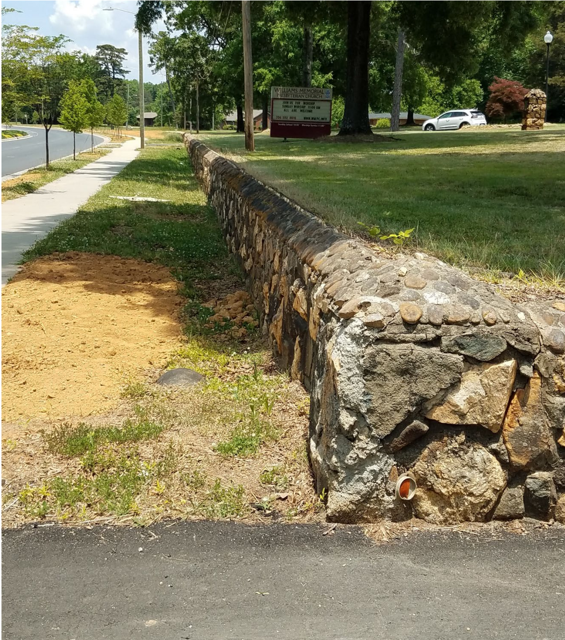
Southern Entrance to Williams Memorial Presbyterian Church Property Looking Toward Northern Terminus of Wall