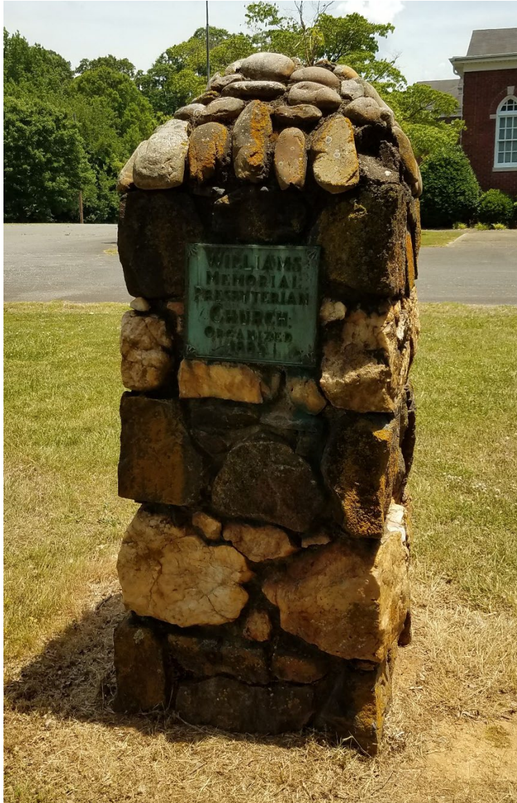
West face of Williams Memorial Church Marker