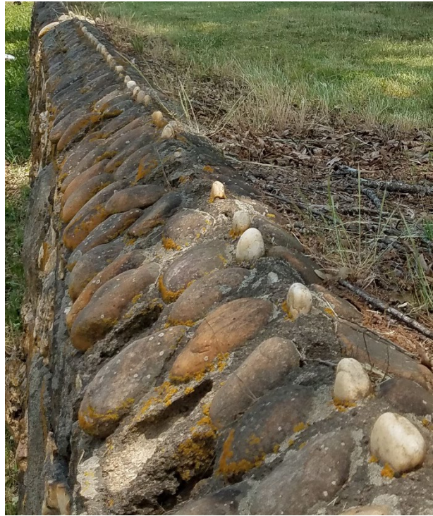
Detail of Domed Cap of Williams Memorial Wall