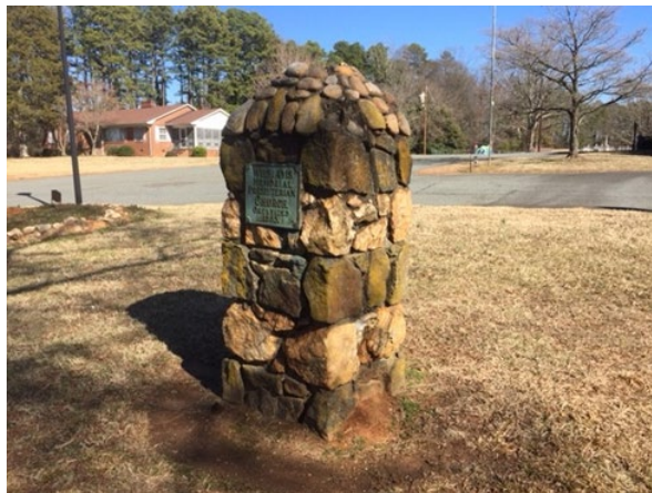
West face of Williams Memorial Presbyterian Church Marker