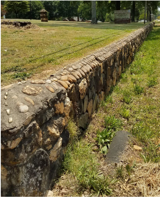
Looking Toward Southern Terminus of Williams Memorial Wall

cap decorated with smaller, smooth stones (also in a random arrangement of white and dark brown), which in turn is topped by an intermittent line of even smaller white stones. All stones are embedded in mortar.