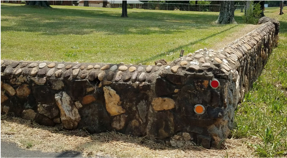
Southern Entrance to Williams Memorial Presbyterian Church Property Looking Toward Southern Terminus of Wall

A stone pier provided by Baxter Davidson stands in front of the main church building, nearly 50 feet behind the stone wall. The pier resembles a similar marker on the grounds of Hopewell Presbyterian Church. Both markers feature a stem composed of alternating strings of rough-faced dark brown stones and strings of rough-faced white stones, all embedded in mortar. Each marker rises perpendicularly from a toeless foundation to a pyramidal cap decorated with small, smooth, lighter-colored stones, and features a metal plaque displaying the name and founding date of the relevant church. Both markers stand approximately 6 feet tall and 2.5 feet in both length and width, but the Hopewell marker has a flint-rock finial fixed atop its cap that adds approximately 12 inches to its overall height. The Williams Memorial marker has no finial, but the slightly flattened top of its cap suggests that a stone finial may have originally topped the pier.