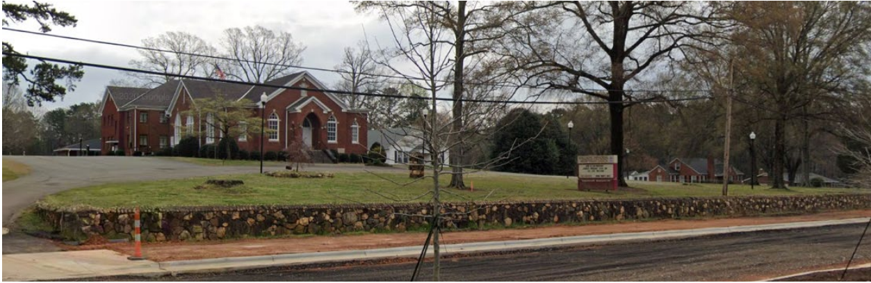
West face of Williams Memorial Presbyterian Church Wall