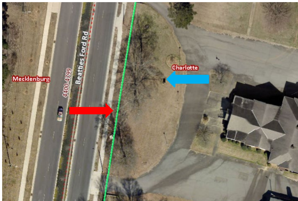
Aerial Image of Williams Memorial Presbyterian Church Wall (red arrow indicates wall's location; blue arrow indicates marker's location)