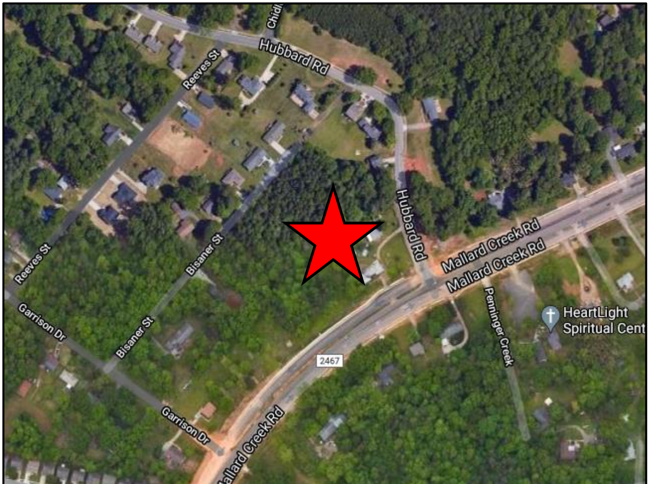
The subject property denoted with a red star.