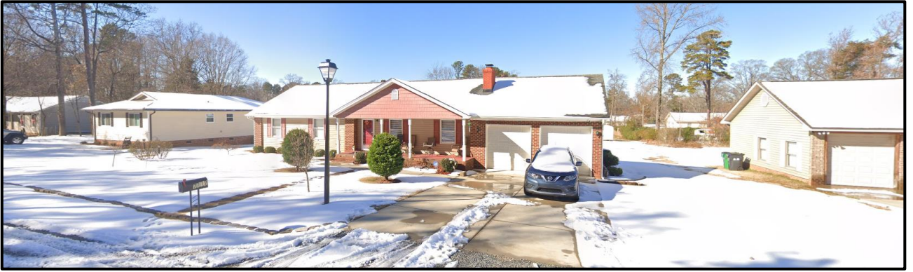
The property to the north and west along Bisaner Street is developed with single family homes.