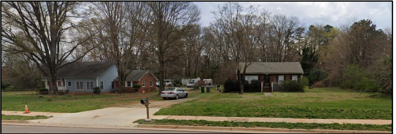
The property to the south across Mallard Creek Road is developed with single family homes.